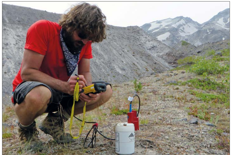
1 Small, cheap and remarkably useful: modern high-frequency seismic nodes are increasingly popular for deployments in remote areas and novel seismological situations.

In 1883, John Milne postulated that earthquake energy could be recorded at great distances (Milne 1883). This was proven in 1889 when a recording of a teleseismic earthquake (from Japan) was made by Ernst Von Rebeur-Paschwitz on a seismometer in Potsdam, Germany (Von Rebeur-Paschwitz 1889). Von Rebeur-Paschwitz soon realized that a set of seismometers deployed at stations globally could enhance