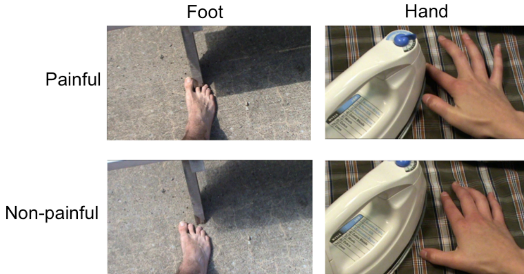
Figure 1. Examples of stimuli, depicting right and left hands and feet in painful and non-painful situations. Stimuli were based on those used by Gu et al (2012).