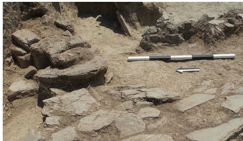
Figure 2. Two courses of mudbrick preserved in situ on top of stone socle recovered from Kaymakçı (KAP 97.545).

While research at Sardis dates to the 1970s, investigations at the Middle to Late Bronze Age site of Kaymakçı (see Figure 1) began in 2012. Three years of excavation on site under the KAP provides critical information about the extent and nature of local mudbrick construction. Excavation and analysis of recovered material reveal evidence of older earthen architecture traditions dating to the second millennium BCE. Despite poor preservation characterizing most architectural evidence of mudbrick, increasing diversification of methods of investigation in recent years (e.g. Love, 2017) enables collection of new, meaningful information regarding production technology and choice. Archaeological data indicate that stone foundations and mudbrick superstructures define normative architectural traditions. While there is an extensive mudbrick corpus, there is limited archaeological evidence for in situ construction. The best-preserved evidence consists of two courses of mudbrick superstructure sheltered from postdepositional degradation and weathering by a fortification wall (Figure 2).