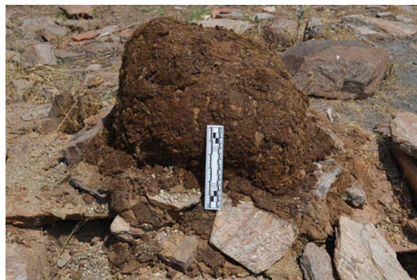
Figure 7. Soft vegetative cap applied to vertical and sloped surfaces of mudbrick (north side) at Eski Haciveliler.

Soft capping experiments at Eski Haciveliler tested vegetative capping materials applied to horizontal and vertical/near vertical mudbrick surfaces secured to a stone foundation. The soft vegetative cap incorporated the following layers placed on top of premoistened mudbricks in this order: mud coating, fine sand, geotextile, mud coating, gravel, mud coating, and vegetation (Figure 7). Following daily wetting and photo-documentation, the completed cap slowly dried for the following 15 days. This process of daily wetting and photographing continued at varying intervals until the end of the dry season. From mid-September 2013 to May 2014, the soft cap was watered and photographed weekly to document changes and characterize the cap's ability to protect the underlying mudbricks. Unsurprisingly, the Eski Haciveliler vegetative cap was unattractive in appearance and vertical/near vertical areas failed to achieve robust plant growth. According to images and verbal reports from collaborators, the vegetation component began to fail on the southern side as early as January 2014. This makes sense given the northerly winds associated with the site. In subsequent months, vegetation on the south side detached from most vertical surfaces. Furthermore, evidence of small mammal or insect damage appeared at the interface of the mudbrick with the stone-masonry substrate.