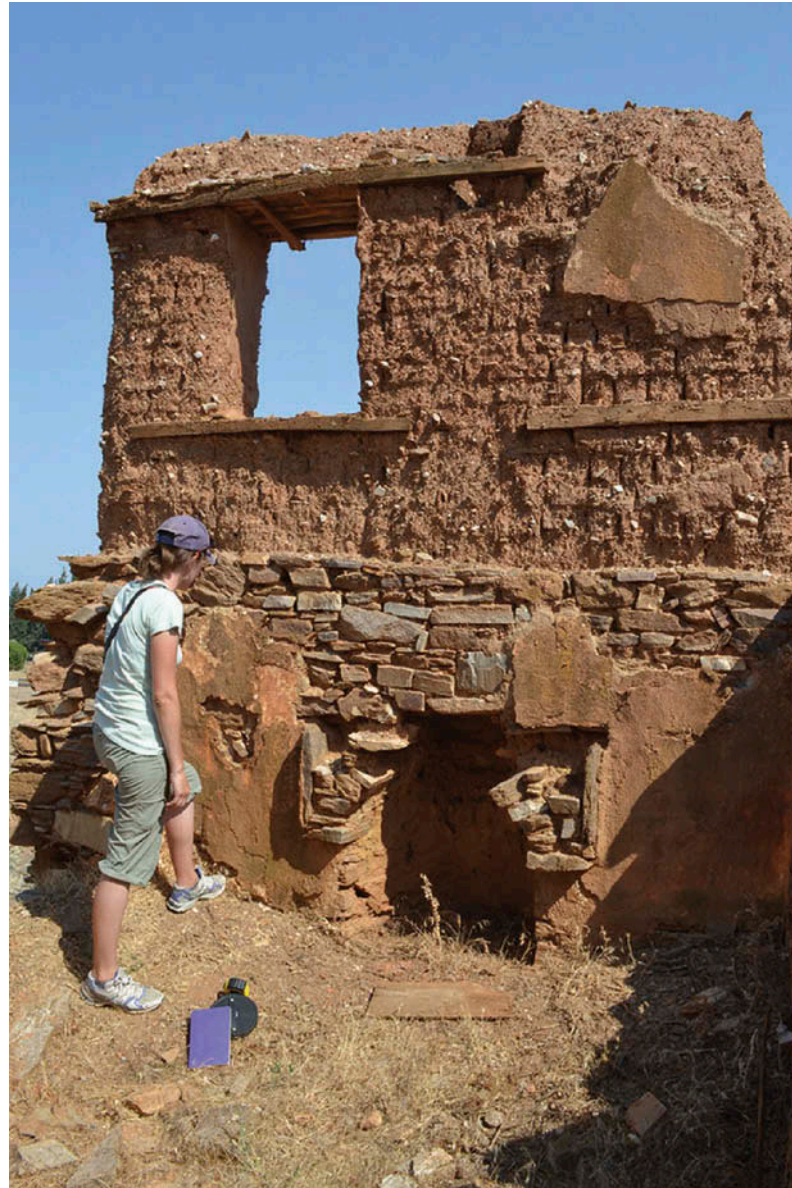
Figure 4. Typical vernacular mudbrick architecture where mudbrick is laid across stone foundations and wood beams provide support; please note areas where original plaster surfaces are preserved, Eski Haciveliler.

coatings, suggesting a frequent maintenance cycle. This differs from ancient mudbricks recovered from Kaymakçı, which incorporate a finer range of aggregate, lower percentage of organic temper, greater variance in standard brick size, and high-fire sintering (see Table 1 and Figure 2).