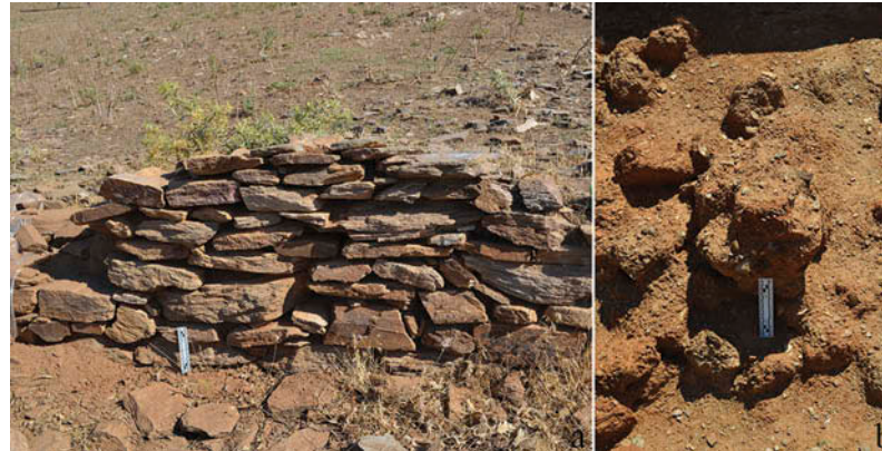
Figure 5. Eski Haciveliler conservation laboratory testing sites: (a) fieldstone masonry wall (south side) surrounding the schoolhouse perimeter and (b) mudbrick wall (west side) from the schoolhouse.

In order to adopt sustainable practices, we investigated a number of recipes based on cement-, lime-, and cement-lime mixtures, given that hydraulic lime is difficult to procure. Tested mortars used locally available soils, collected from Eski Haciveliler (EH1, EH2, and EH3) and Tekelioğlu (T4). Following instruction from local experts, sieving removed aggregate (small pebbles and rock), organic detritus, and other components from selected soils in order to produce a homogenous matrix for use in mortar recipes. Cement-, lime-, and cement-lime-based mortars were tested using different recipes to determine the most appropriate working and drying properties for use in repointing. All mortar recipes were prepared using water from the nearby fountain (çeşme) on site. 2