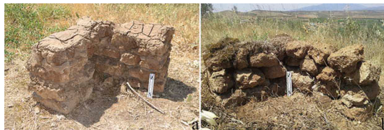
Figure 6. Tekelioğlu experimental L-shaped mudbrick wall: (a) just after construction in July 2013 (southeast side) and (b) 11 months later in June 2014 (southeast side).

Following the end of the 2013 field season, local colleagues continued to monitor the wall—wetting and photographing daily for an additional 2 weeks during the dry season. Thereafter, the wall was inspected on variable intervals (2–3 times per week, once per week, once every other week). Throughout this period, we were in regular discussion with our collaborators and made protocol adjustments based on their observations and knowledge of the environment. This dialogue was critical and resulted in the removal of the plastic covering 4 weeks after the date originally