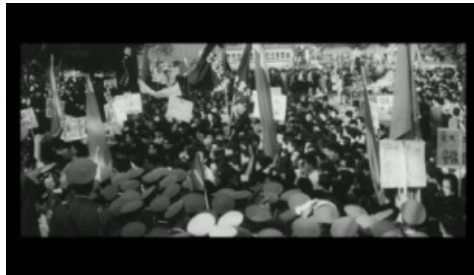
Demonstrations against ANPO in Good for Nothing (Yoshishige Yoshida, 1960).