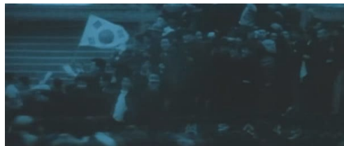
Newsreel on the April Revolution in South Korea. Cruel Story of Youth (Seishun zankoku monogatari, Nagisa Ōshima, 1960)

These demands of further realism coincided with a moment of great political tension as a result of the renewal of the US-Japan Security Treaty (ANPO), signed in 1952. It needed to be ratified in 1960 and this prompted massive protests and unrest over the decade. The new generation of filmmakers was heavily conditioned by this political instability. Films journalistically documented current affairs, such as the student demonstration appearing in Yoshida's Good for Nothing (Roku de nashi, 1960) and Oshima's Cruel story of Youth (Seishun zankoku monogatari, 1960) – the latter of which included newsreel images of the April Revolution in South Korea, and also a sequence in which the protagonists witness a student demonstration in Tokyo. Twelve days after the release of Cruel Story of Youth , the great demonstration of 15 th June took place, and Oshima based his following film, Night and Fog in Japan (Nihon no yoru to kiri, 1960), on this event.