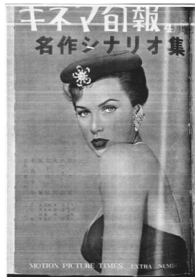
Bad Boys ' script in Kinema Junpō . Meisaku shinarioshū , 4-1960, pp.135-142

Hani was not only aware of the political leanings of the avant-garde documentary movement of the fifties but, as we have seen at the beginning of this text, he even made significant contributions to it in both theoretical and practical terms. Bearing that in mind, the lack of sequences featuring student protests in Bad Boys , which is another youth film released in 1960, conveying similar aesthetic and narrative concerns to those of Oshima and Yoshida, is somewhat striking. In addition, the fact that, compared to said filmmakers, Hani goes one step further by adapting non-fiction formats –by working with real youth delinquents, shooting entirely on location with mostly hand-held camera— makes this apparent oversight even more remarkable. However, the Bad Boys script published in June 1960 by the journal Kinema Junpō reveals the existence of several scenes of student demonstrations that are absent in the film. In fact, they appear up to three times throughout the written text: in scene 2, again in scene 25 and finally, in scene 76.