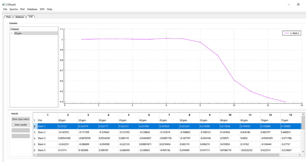
Figure 3. An example of an analysis using the “SVD” tab function. The name of the component files of the datasets used are in the upper left hand panel, with the right hand upper panel displaying the plot derived for the highlighted data set (lower right panel, blue overlay). The data used in these plots are from reference 12.

example, analyses of protein stability, especially as part of thermal melt studies. 12