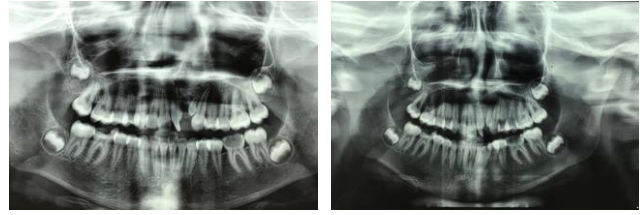
Figure 5: Preoperative panorama (left); Postoperative panorama (right)

difference between the two groups. The difference between the two groups was considered statistically significant when p < 0.05 , and considered highly statistically significant when p < 0.01 .