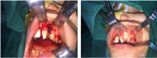
Figure 3: Alveolar cleft defect (left); Alveolar cleft grafting (right)

Group C: Stem cells extracted from bone marrow aspirated from iliac crest using a biopsy needle. PRP obtained by citrated 10 cc syringe after being centrifuged for 15 minutes with 2500 rpm speed to separate the plasma portion rich with growth factors and mixed with bone marrow cells aspirate and packed into cleft site Figure 3.