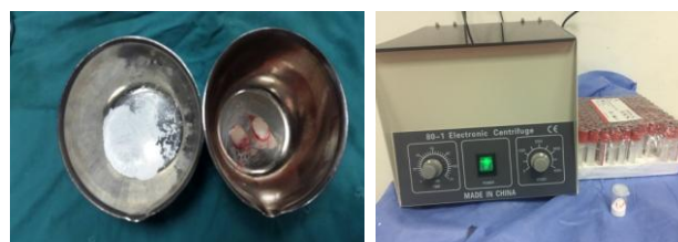
Figure 2: Nano calcium & collagen (left); PRP centrifuge (right)

Surgical procedures: Under GA with full aseptic conditions. A full mucoperiosteal flap was reflected from first premolar region to the central incisor. Separation of oral and nasal layers and closure of fistula was done.