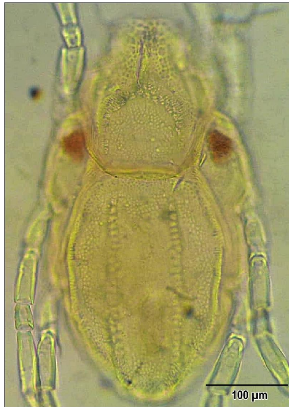
Figure 2. Plegadognathus bonariensis (Viets, 1936) – Dorsal habitus.