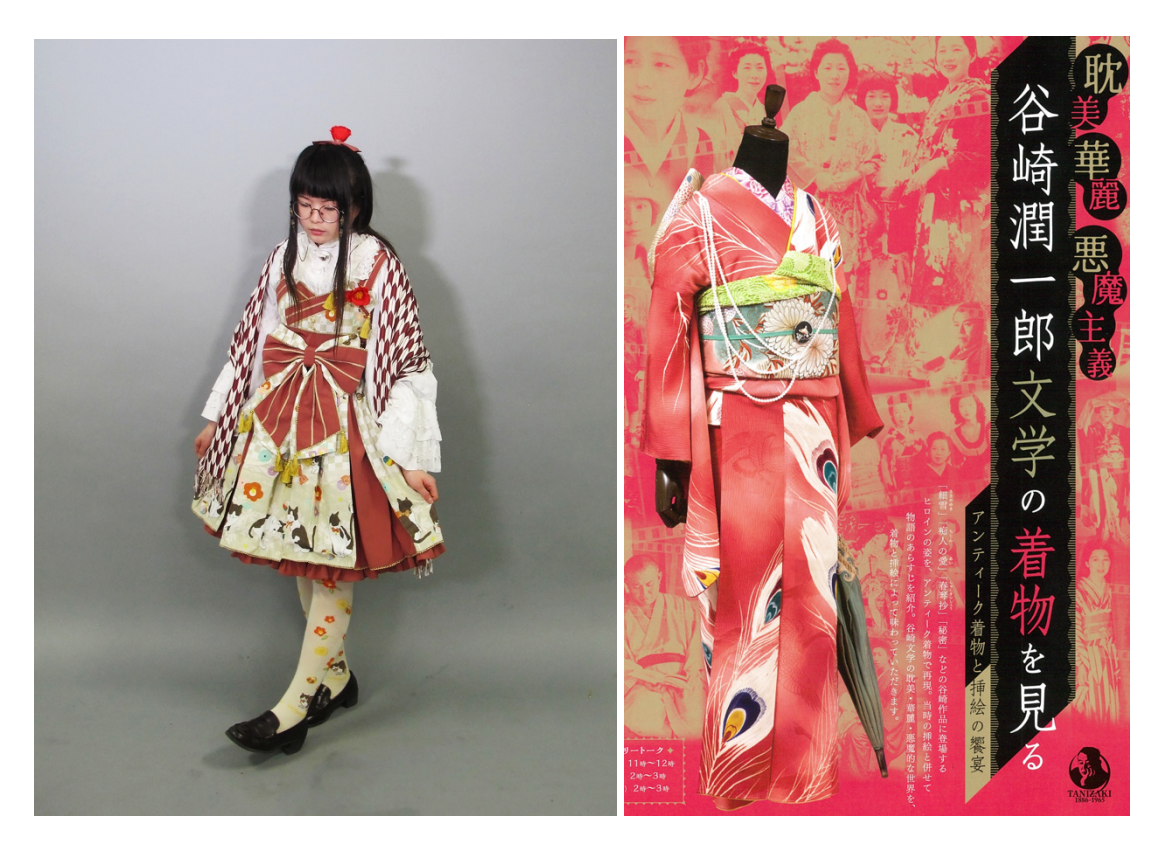
Fig. 1. (Left) A set of Lolita outfit in Wa-Lolita \pi \square \square \square \square \square \square \square \square \square \square \square "Japanese Lolita" style, which is a variant in Lolita fashion. Wa-Lolita features a fusion of Western and traditional Japanese designs and patterns, reminding of the Taisho modern fashion in Tanizaki's Naomi .

Fig. 2. (Right) A poster of a contemporary fashion exhibition that replicates kimono in Taishomodern style as described in in Tanizaki's oeuvre. " Tanizaki Jun'ichiro bungaku no kimono wo miru 谷崎潤一郎文学の着物を見る [Tanizaki Jun'ichiro's. "Kimono." Literature]"Yayo Museum & Takehisa Yumeji Museum. http://www.yayoi-yumejimuseum.jp/yayoi/exhibition/past_detail.html?id=640. Accessed 23 Mar. 2018.