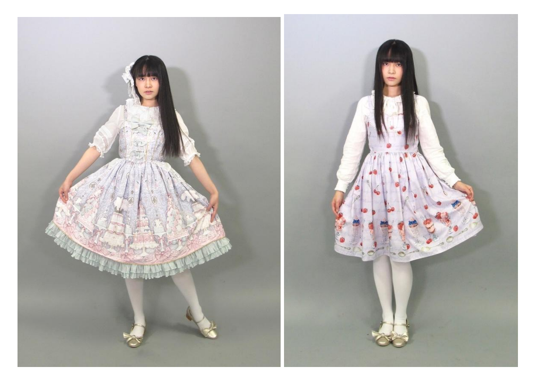
Fig. 4. (Left) A set of Lolita outfit in Ama-loli \nexists \square \mathcal{Y} "Sweet Lolita" style, which is a variant in Lolita fashion. (Right) Another set of the Sweet Lolita style that looks more quotidian without ruffle or petticoat under the dress. Sweets, fruits, and cakes are typical design elements for a Sweet Lolita dress, often with Alice /fairytale references and in pastel tone (Bernal 64).

Bernal did an attentive study of the Gothic and Lolita subculture in 2011, in which she defines the Lolita culture, or Gothic Lolita in general, as a Neo-Gothic subculture originating in Japan, with multiple variants. The Lolita subculture is a demonstration of "a reluctance to move into the uncertain adult world, a wish to escape reality, and a subconscious desire to remain in, or return to, the security of childhood", and hence "symbolized in the impulse to dress as a child" (Bernal 51).