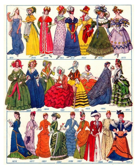
Fig. 7. "Illustration depicting fashions throughout the 19<sup>th</sup> century" in "Victorian Fashion". Detail. Wikimedia Commons . https://commons.wikimedia.org/ wiki/File:Fashions.jpg. Accessed 23 Mar. 2018.

Fig. 6. (Right) A set of Country Lolita outfit, such design is generally inspired by the countryside and Victorian farms, marked by floral pattern, frill, sometimes an apron, and with accessories such as a straw hat, as shown in the figure. Photo courtesy of the author.