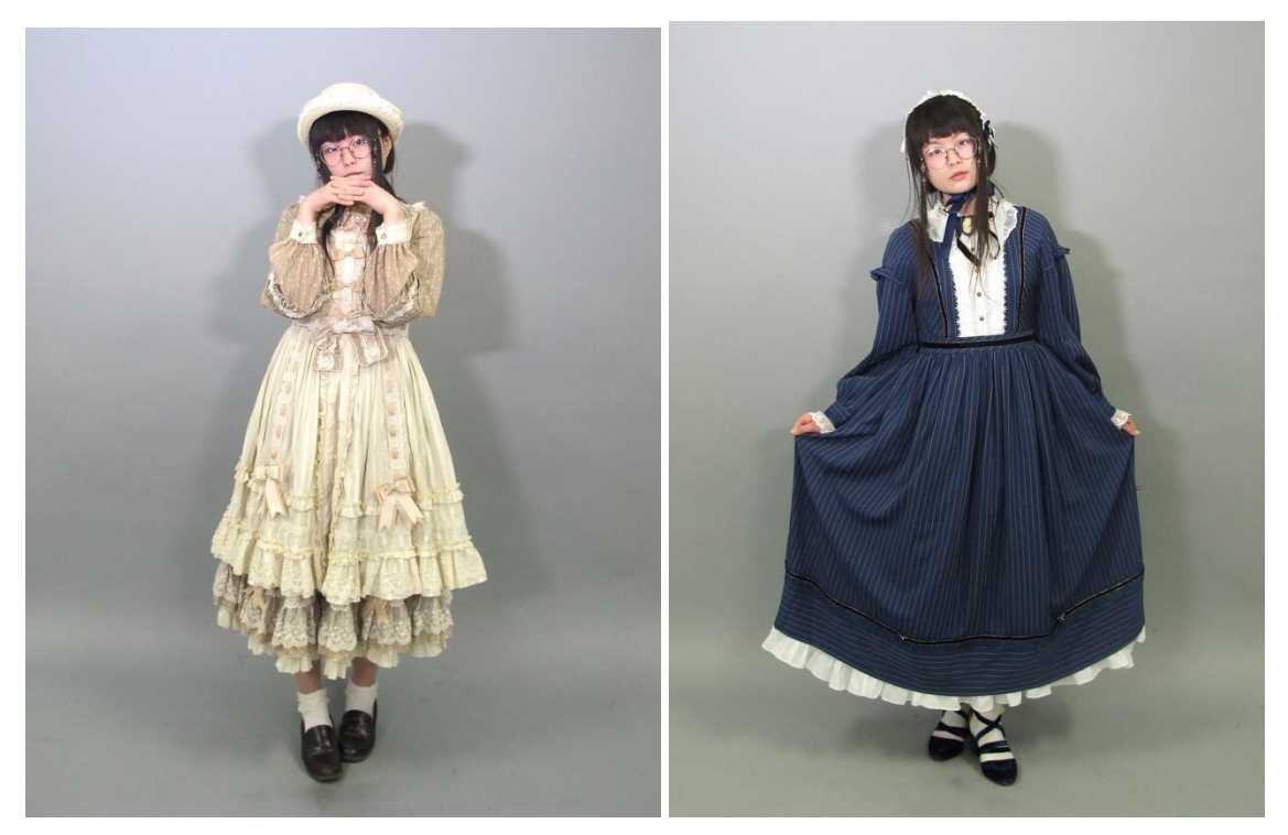
Fig. 5. (Left) A set of Classic Lolita outfit that makes the person appear to be a vintage Victorian doll or child in storybook. "The bodice should finish at the natural waist or just above it, exaggerating the impression of the Child's physique, and the skirt of the dress will be full-circled or bell-shaped. A headdress is expected and may be in the form of a Victorian-style band, bonnet, or bow headband" (Bernal 55).

The Classic Lolita, as well as the Country Lolita (fig. 6), are much inspired by doll and children's dresses seen in Victorian-style costumes (fig. 7) and storybooks. An example would be Alice's dress in the popular story Alice in Wonderland . The story of Alice as well as Alice herself also has become a symbol of a shōjo and her fantasy world, "where such a childhood exists" (qtd. in Hinton 1596).