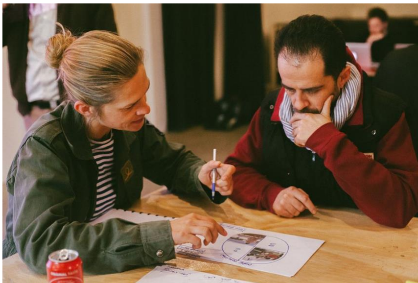
Figure 5: Testing paper prototypes at the end of Story Booster 2017. IF Lab.

For example, a participant that came with a project that explores the closure of a nuclear power station and the impact on the community who live and work in and around the power station, would have been asked in the first two days to decide if the main target audience is the community living around the nuclear power station, or a general public interested in environmental issues. Depending on the decision of the author, a discussion on the best possible platform would follow: a web-based project, a geo-tagged mobile app or an aural tour of the premises? Then, a paper prototype tested by other IF Lab participants would serve as a first feedback opportunity, but the author would be asked to engage with her chosen audience during the two months following Story Booster. Changes to the project interface, structure and content would then be presented at Prototype Boosters, ready for another circle of iterations.