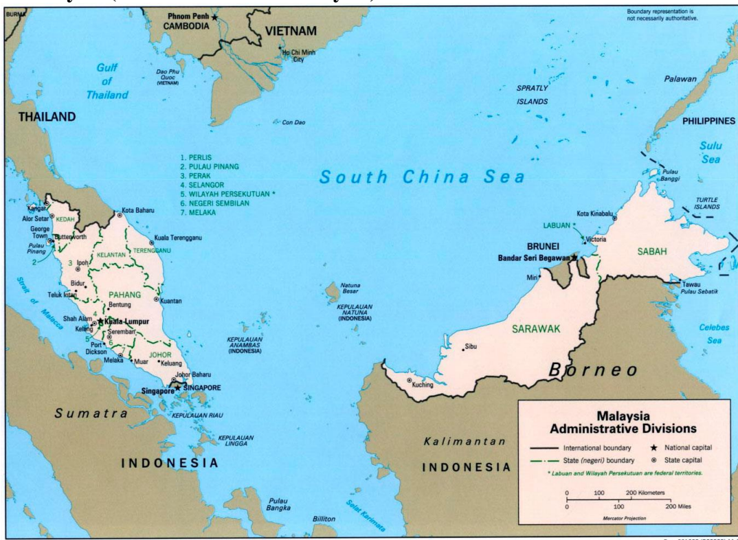
Map 2: Malaysia (Peninsula & East Malaysia)

With support from Tenaganita, I conducted in-depth interviews with: (1) government officials (Department of Labour, Human Rights Commission of Malaysia (Suhakam) member of the parliament of Malaysia, Embassy of the Republic of Indonesia, Kuala Lumpur, Embassy of Japan in Malaysia); (2) CSOs (NGOs (Malaysian & Indonesian), Trade Union (Malaysian & Indonesian), Indonesian informal groups, media); (3) business community (recruitment and