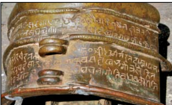
Figures 4 and 5

dāti , perhaps for ( a ) dāt . A probable two syllables giving the name of their residence seem abraded beyond recall, and one conjunct ( pa[.]aca ) seems indecipherable. It is, however, pleasing that these two interesting artifacts can be recorded here for posterity.