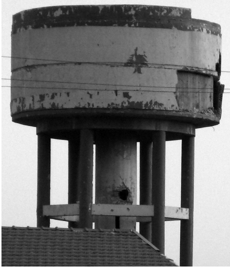
Figure 3. Wazzani Pumping Station Reservoir