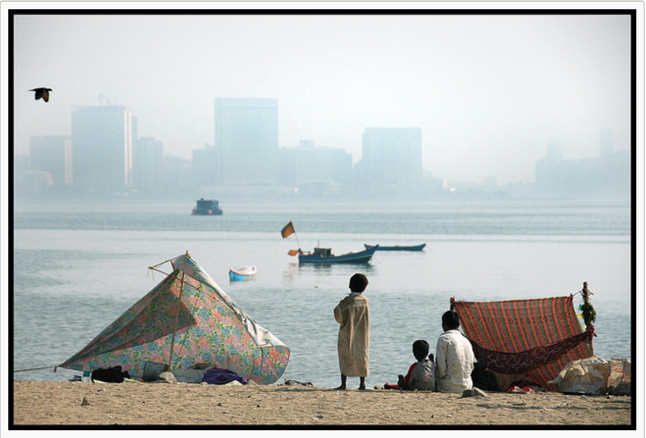
'Looking out across the bay at some of the most expensive land in the world. Chowpatty Beach, Mumbai.'

links, online newspaper articles and so on add an up-to-date and interactive edge to the learning experience (although inputting convoluted website addresses can be cumbersome). The guides to further reading are supplemented with an explanatory paragraph for each text rather than an unhelpful reference alone, and encouragingly the key learning tasks urge the student reader to develop their own ideological position rather than simply proselytising, an approach that will no doubt prove useful to students in the long run.