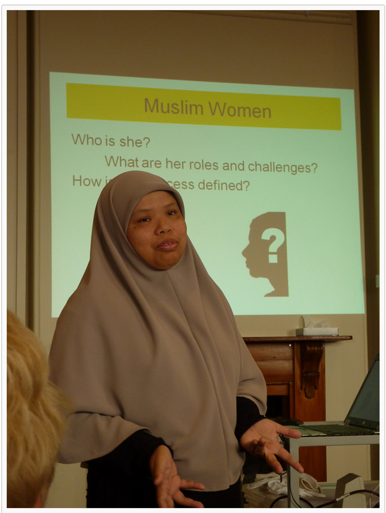
Participants at the 'Countering stereotypes – being a Muslim woman in South Australia' exhibition discuss what it means to be a Muslim woman in the region today.

Abu-Lughod's principal focus is the Arab world, and many of the examples she uses are from rural