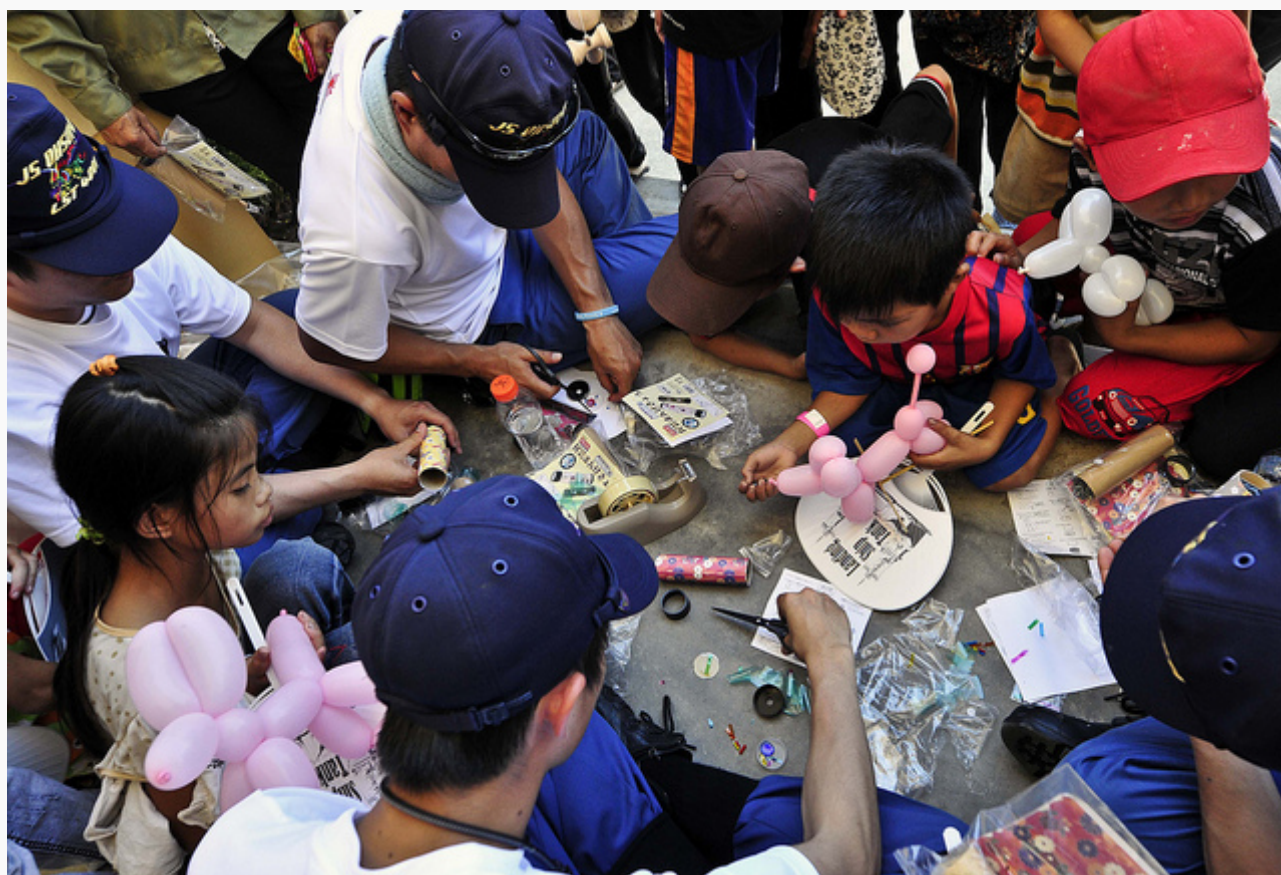
Members of the Japan Maritime Self-Defense Force show Vietnamese children how to create kaleidoscopes during a medical civic action project at Hung Linh for Pacific Partnership 2012.