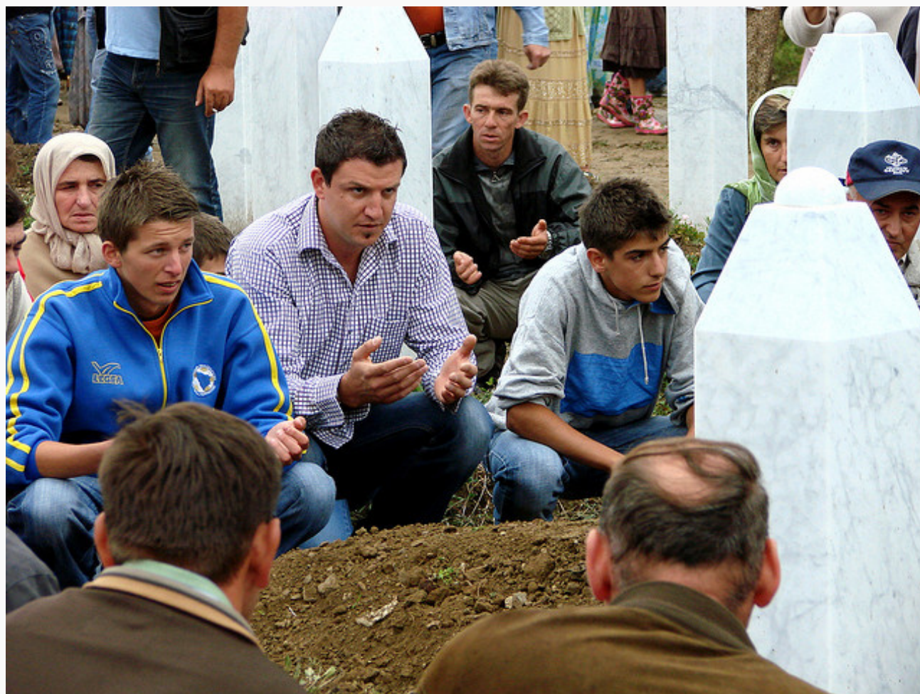
Srebrenica Massacre – Reinterment and Memorial Ceremony – July 2007.