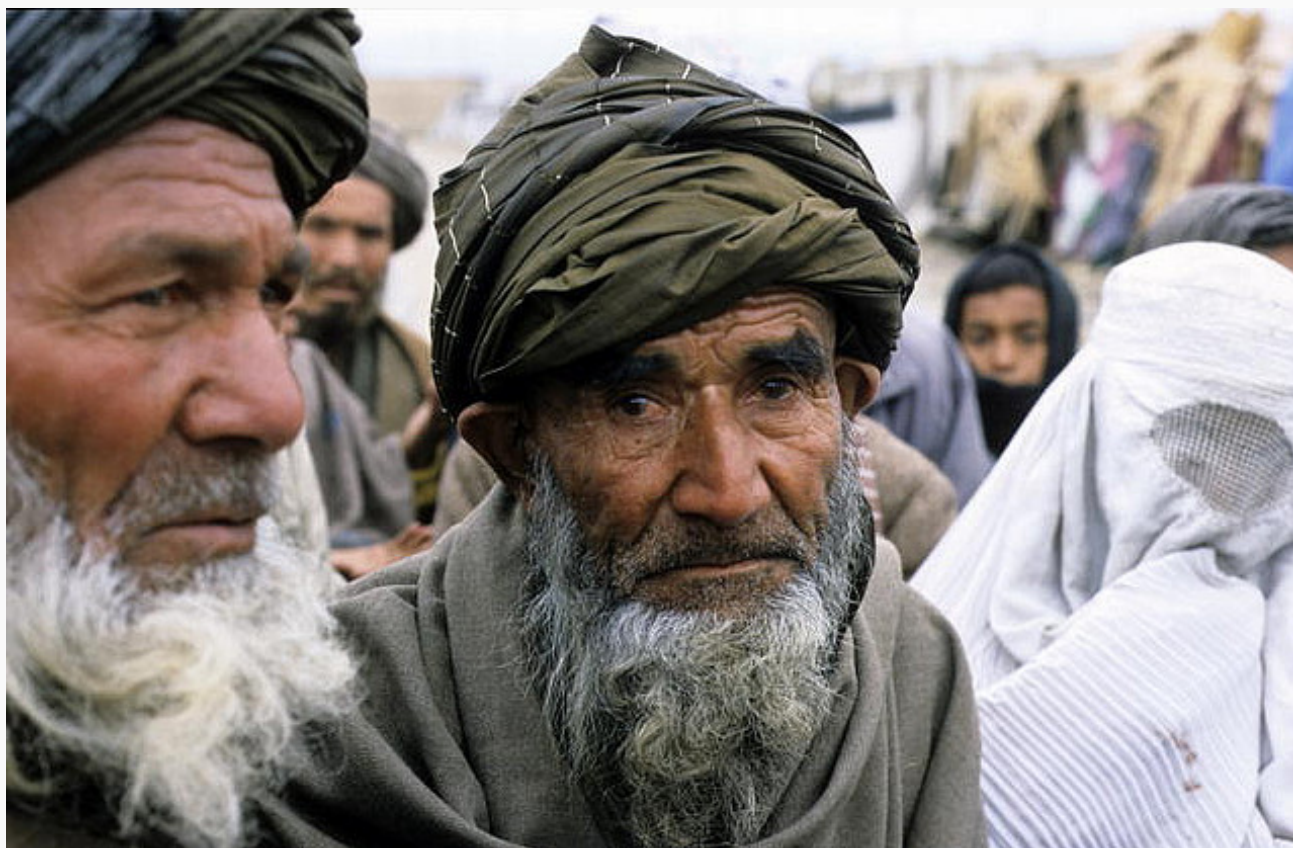
An elderly Afghan man at an International Red Cross Distribution camp.

allowed for international terrorism to gain a foothold in the region. Increased global awareness of the country saw a decrease in