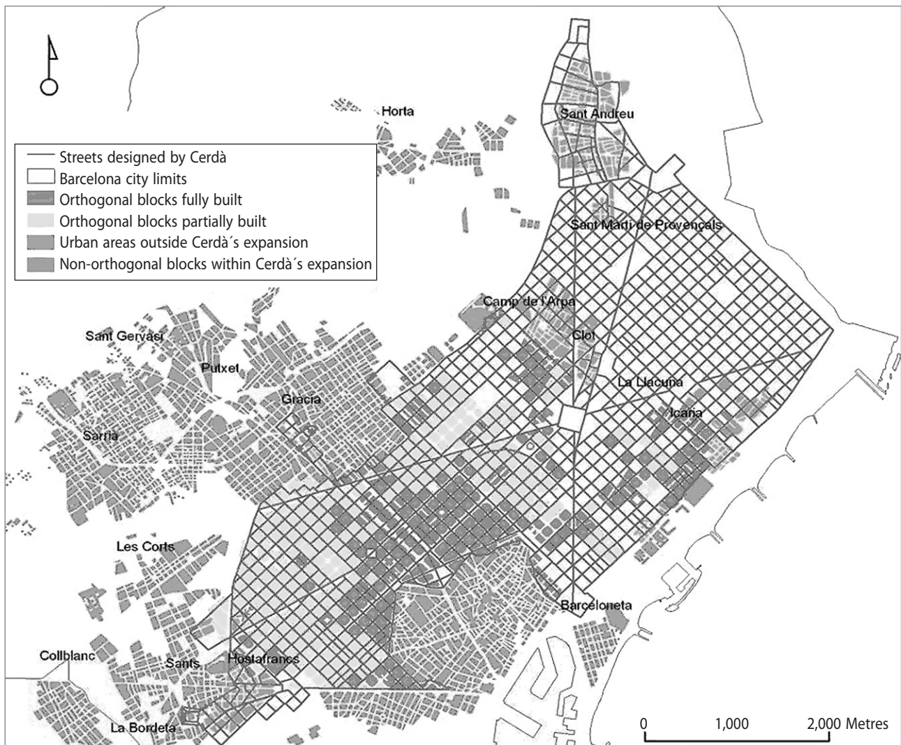
Figure 4: Barcelona's built environment in 1926.

port were located. By 1926, the national topographic map of Spain (Span. Mapa Topográfico Nacional de España ) showed the urban space scattered across the plain and some of Cerdà's block morphology built and streets delineated (Figure 4).