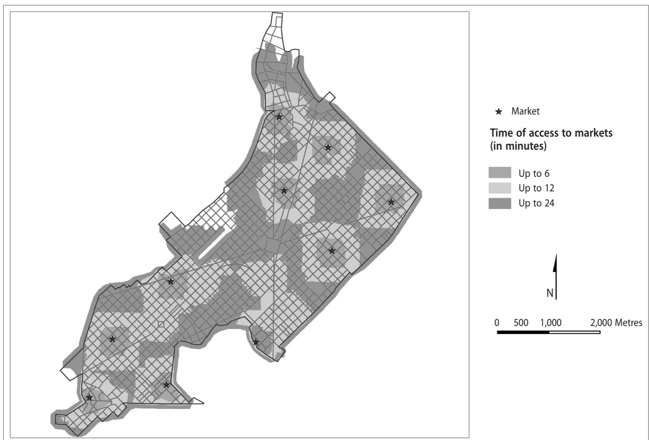
Figure 8: Spatial analysis: Marketplace service areas.

The group of facilities proposed in the map is parks, hospitals, schools, state facilities, markets and "social facilities" (Figure 6). In this paper we analyse the service areas of markets and hospitals using ArcGIS Spatial Analyst. Two variables entering into the analysis are facilities' location and population in demand points. The expected results would give the service area within a distance time away from the location facility and the population covered within this area. Introducing different intervals of time around the point where the facility is located into the analysis would give different scenarios in which a different proportion of population is served by a facility, and the maximum time this population must travel to reach the service. Further research, which is beyond the scope of this