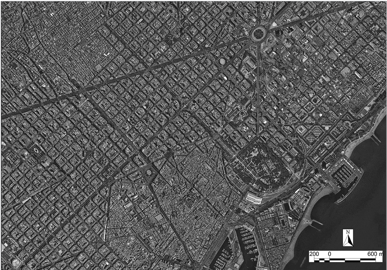
Figure 9: Orthophoto map of Barcelona (source: Cartographic Institute of Catalonia, 2010).

The structural question of this paper was to examine how good urban planning can be used to improve wellbeing. Assumptions have been made associating good health and good quality of life with service provision to improve wellbeing. We tested what level of the population was served by the location of hospitals and markets proposed by Cerdà, as opposed to the null provision in the Old City. Cerdà's idea of service efficiency was in part a solution stemming from common sense and from the progressive goal that the poor conditions of the working population could be improved through good urban planning. In this paper we worked with modern location theory models and GIS to analyse his results; in fact, service-area analysis of hospitals and markets has been useful for finding primary solutions to this problem. Specifically, and with restrictions to be relaxed in a future analysis, we have shown that 78% of Barcelona's Expansion section population has a hospital within 30 minutes' walking distance and 95% of the population is within a maximum of a 24-minute walk to a market. Many things can be achieved in future research. Most of these fall under the following proposals: considering facility location as an endogenous variable of the model, taking into account the capacity of services, introducing different population densities, introducing a different typology of services, individual decisions affecting wellbeing, a heterogeneous population, various