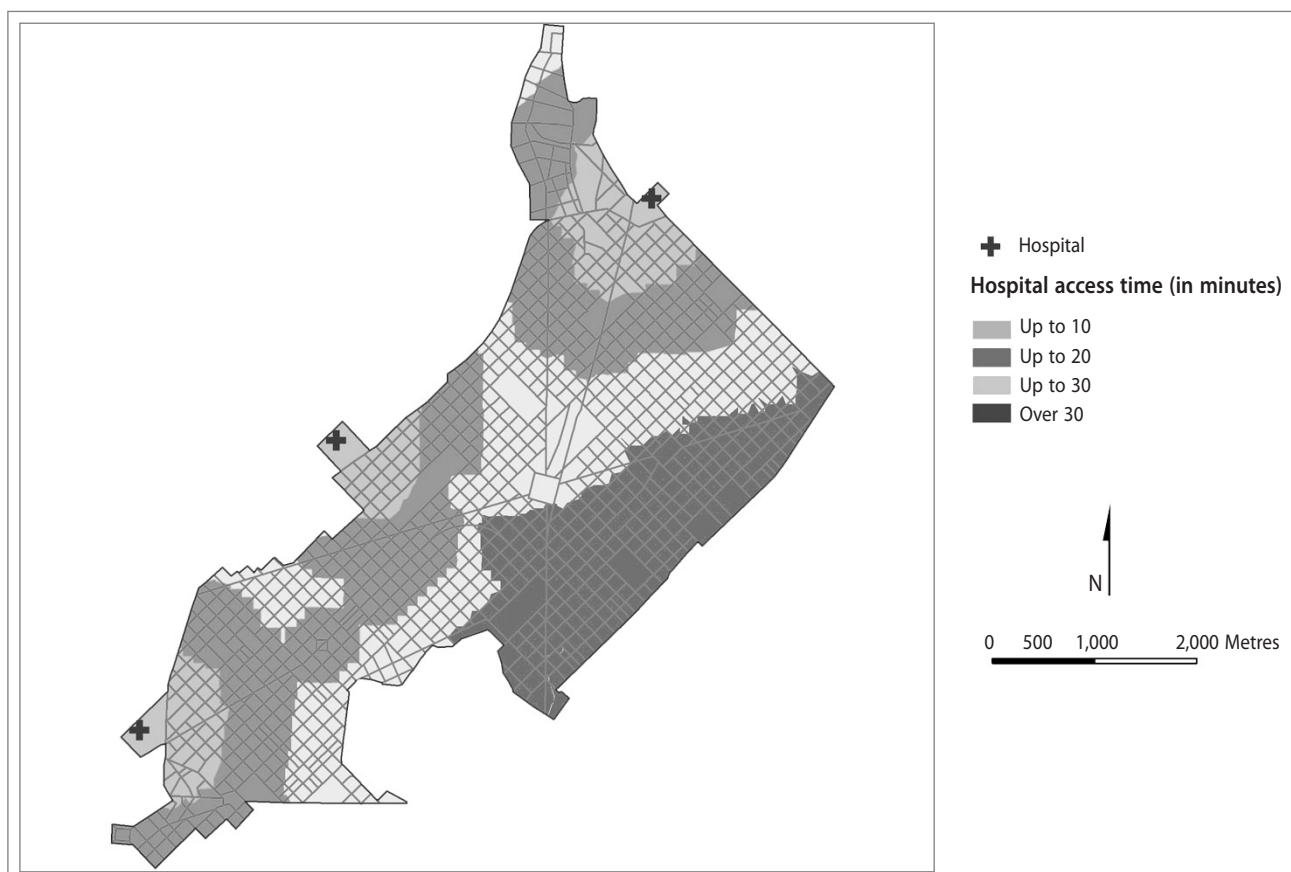
Figure 7: Spatial analysis: Hospital service areas (source: Cerdà, 1861; Cartographic Institute of Catalonia, 2006).

We based our analysis on the data found in Cerdà's urban plan documents, in which he proposed a density of 250 inhabitants per hectare and 40 square metres per person. The number of facilities and their locations is taken from the set that Cerdà planned in his map. The number of demand points is 926 centroids. For the analysis, we considered the population centroid to be located in the centre of each block. The population in each demand point or centroid is calculated taking into account the parameters given by Cerdà, in relation to types of housing for different classes of the population; and assuming social classes are mixed in each block. Percentages of population per income level are calculated based on the proportion that the Barcelona census of 1856 gave regarding various professions and considering the percentage of construction