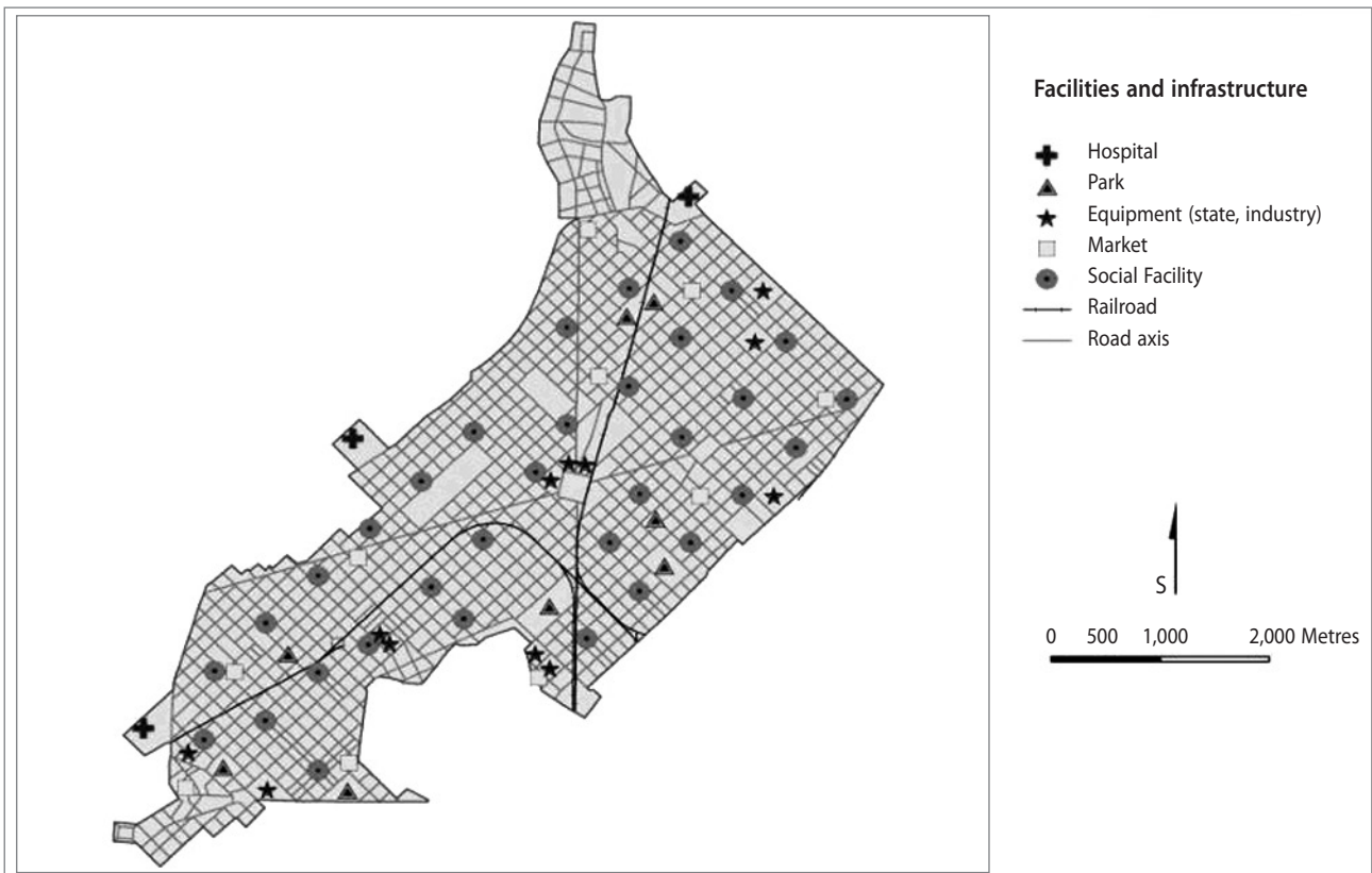
Figure 6: Cerdà's facility location pattern (source: Cerdà, 1861).

The substantial idea at the root of Cerdà's proposal for designing a city for the new industrial era contained many elements of present-day cities; and in proposing this he was implicitly "scientifically" rejecting the old pattern implied by the city of