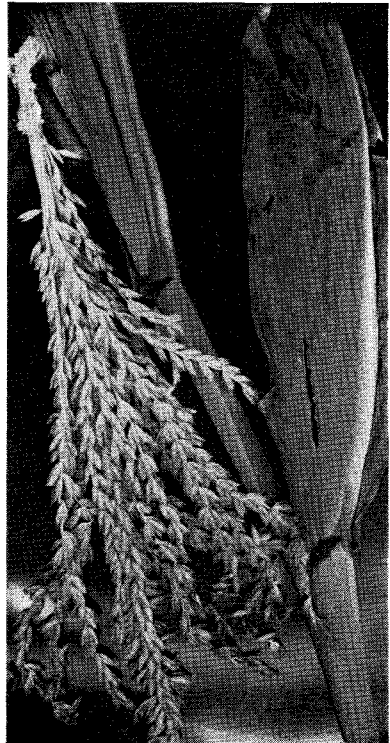
FIG. 3—Tassel broken over because of borer.

The mature borer (larva) is slightly less than an inch in length, pale flesh in color, relatively hairless, and marked with dark spots (see front cover, below). The untrained observer may confuse these borers with