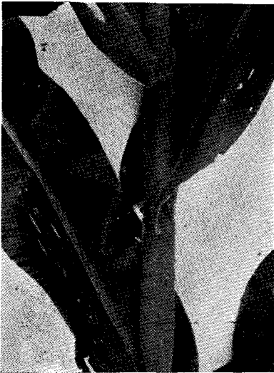
FIG. 1.—Feeding scars of young larvae on corn leaves (after Drake & Harris).

As the name indicates, the European corn borer is of foreign origin, presumably introduced in a shipment of broomcorn from Europe. First discovered in this country in 1917 on the east coast, by 1930 it had moved westward into Illinois. The drouth of the 1930's temporarily checked the spread of this pest, but with the return of more favorable corn growing weather since about 1940, its westward movement was resumed. The first infestation of the European corn borer in Iowa was reported along the Mississippi River in 1942 and two years later, it was found in Nebraska.