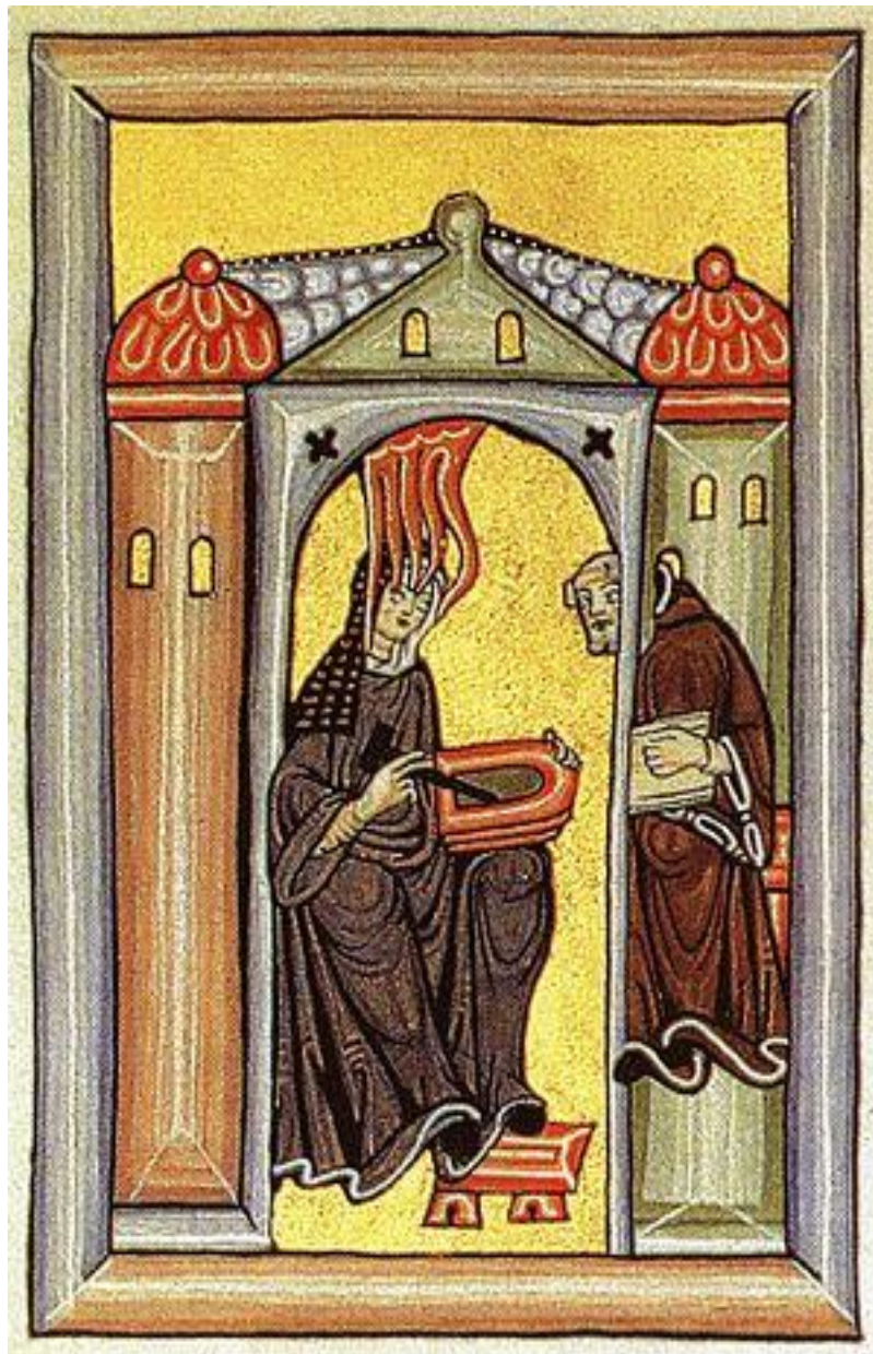
(Rupertsberg Scivias , formerly Wiesbaden, Hessisches Landesbibliothek MS 1, frontispiece)