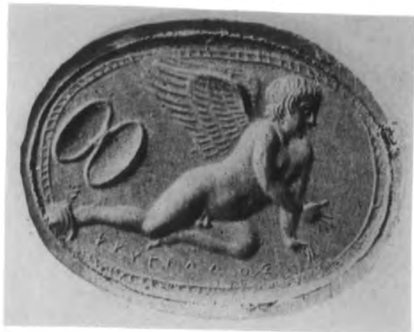
THE GEM (x2).