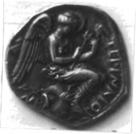
REGLING S/YY (x3).