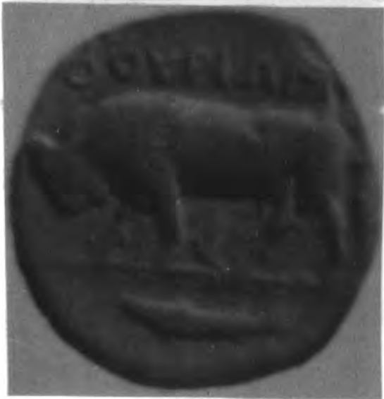
THURII No. 10 (x4).