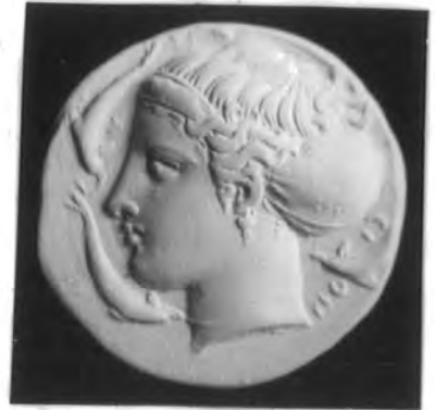
TUDEEK REV. 29 (x2). TUDEEK OBV. 16 (x2).