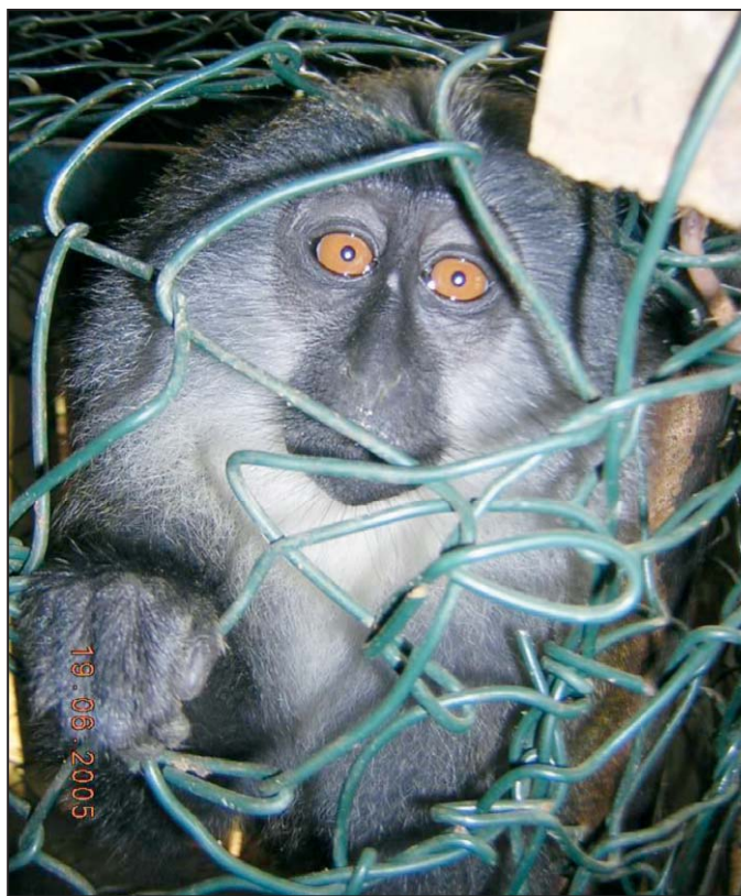
Figure 3. Young female Cercopithecus solatus captured in the buffer zone of Mount Birougou National Park, southern Gabon, in June 2005.

villagers brought him a juvenile female in early June 2005 (Fig. 3). It had been caught in a ground snare in the northeastern buffer area of Mount Birougou National Park, in a hilly area (altitude 600 m). In the early afternoon of 8 March 2004, Tanga observed a single adult resting on a tree branch at the forest edge along the road between Popa and Mbigou Moréné (01°31'12"S, 12°17'24"E; altitude 355 m; Lolo-Bouenguidi Department, Ogooué-Lolo Province).