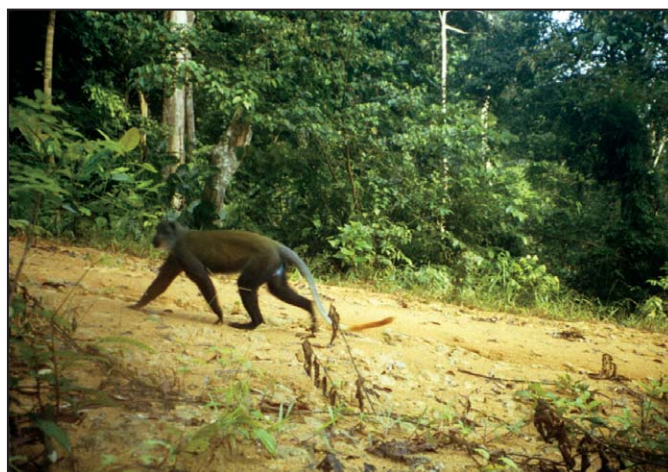
Figure 4. Cercopithecus solatus photo taken using camera trapping, close to Mount Mimongo.

Fifteen camera traps were deployed in a 30-km 2 study area over 54 days between 28 August and 21 October 2004 in an area about 10 km to the south of the southern bank of the Lolo River. No images of C. solatus were obtained. This indicates that the species is either absent or very rare south of the Lolo River. Lauren Coad and local field assistants conducted a hunting study from January 2004 to January 2005 in the same area in two villages, Dibouka (01°19'07"S, 12°12'54"E) and Kouagna (01°18'28"S, 12°13'45"E). Their results showed considerable hunting pressure that was highest within 5 km from the villages, but also extended up to hunting camps 12 km to the north, on the southern bank of the Lolo. During this study all hunting returns for the two villages were recorded, and no C. solatus were ever caught or seen. During a previous hunting study in these villages conducted by Malcolm Starkey from 2000 to 2002, no C. solatus were