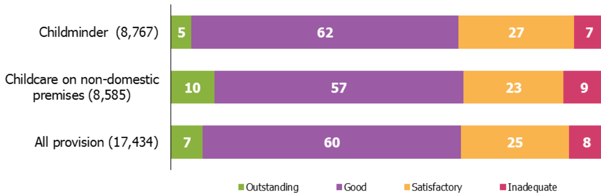
Chart 1: Overall effectiveness of early years registered providers inspected between 1 September 2012 and 31 October 2013, by provider type (provisional) 1 2 3