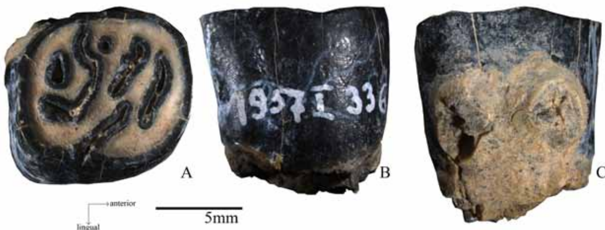
Figure 1: Hystrix ( H. ) cf. primigenia (Wagner, 1848) from Taşkinpaşa. Right M1 or M2 (SNSB-BSPG 1957 I 336); (a) occlusal view; (b) lingual view; (c) labial view.

The tooth (Fig. 1) belongs to a relatively old individual, and has a rounded outline, as it is often the case at this stage of wear (Fistani et al. 1997).