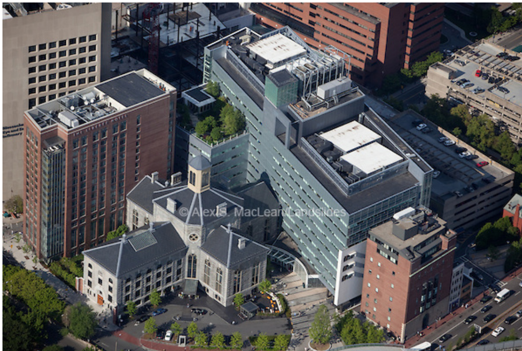
Completed Project: The Yawkey Center, and The Liberty Hotel, 2011 35 .

vibrations that could distort the effectiveness of the equipment, and the developer was concerned about the presence of any radiation that could harm workers and future hotel guests 34 . The concerns and goals around this topic for each party were quite different, but through proper logistics coordination and construction planning, Carpenter was able to manage the vibrations with no negative effects on the hospital or its highly sensitive equipment.