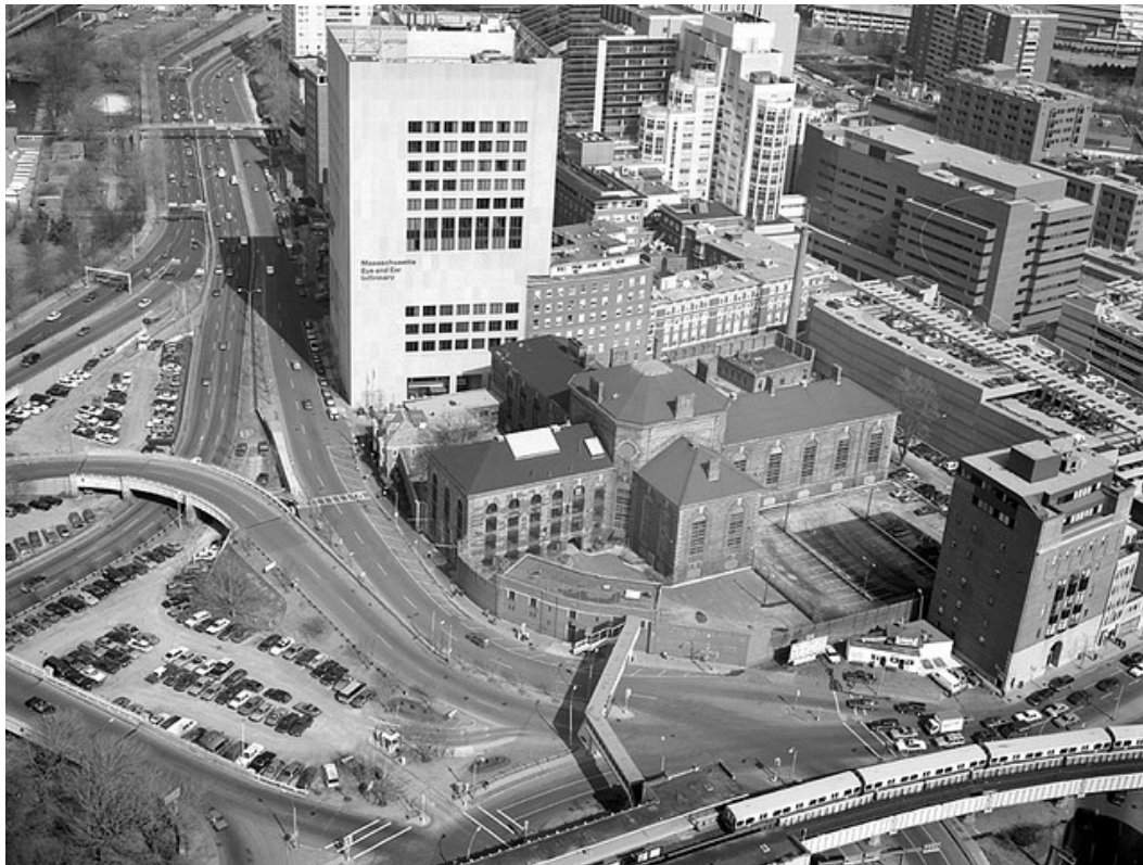
The Charles Street Jail, 1980's 20 .

to sell the property in 1991. Due to its history, and highly visible location, the original jail was listed on both the State and National Registries of Historic Places 19 .