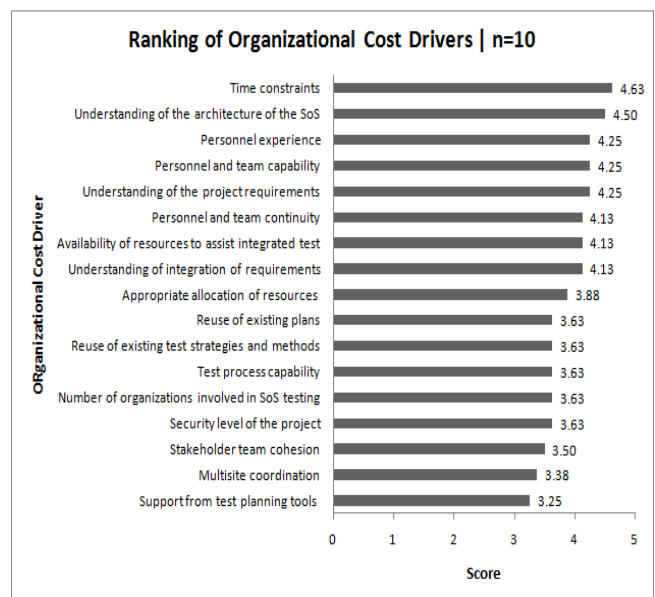
Fig. 2 Prioritization of Organizational Cost Drivers for UASoS T&E