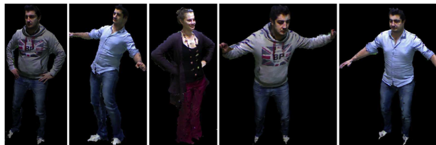
(a) 3D reconstructions of moving humans in various poses

This will demonstrate real-time 3D human reconstruction from multiple Kinect RGB+depth cameras. It will present various textured 3D reconstruction results from various view points, both for still and moving humans ‡ .