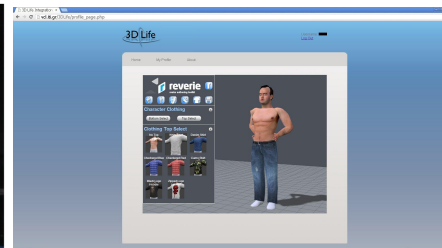
(c) The REVERIE avatar authoring tool