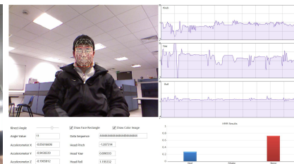
(e) Real-time head nod and shake detector