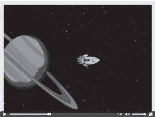
Fig.3 A screen shot of the solar system grand tour in Uchu Game.

Dušan performed together. Uchu Game, a package of electronic astronomy education materials developed by us, was presented (see figure 1). Children enjoyed the daily cycle of the Sun and the Moon motions with lovely characters, and the imaginary space trip by a nice rocket through solar system (see figures 2 and 3). Children were also eager to ask Dušan questions. Tomita translated children's Japanese into English.