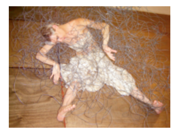
Fig. 2 Vera Sala