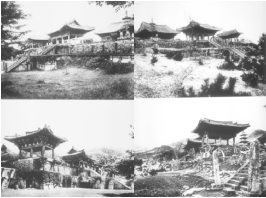
Fig. 7 Ruins of Pulguksa before (Right, 1913) and after reconstruction, Kyōngju (Left, 1938)

Authors' caption: Top: Note the crumbling bridges and foundations on both the eastern and western edges.