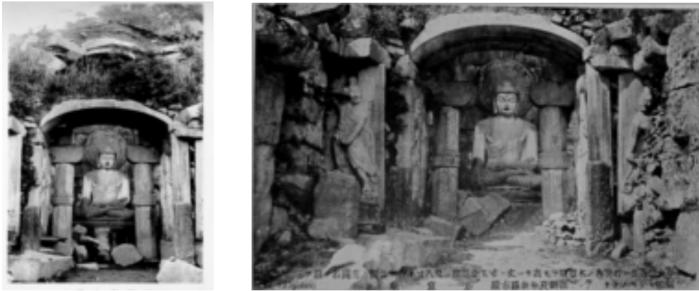
Fig.4 Sökkuram entrance before reconstruction (c. 1911–12)

Left: Source-Silla Koseki Sekutsuan (Zen), (Photo-album), n.d. Courtesy of the Collections of Kyoto University Department of Archaeology; Right: Postcard stamped with name of publisher, Tōyōken photo-studio of Kyōngju, Title: Chōsen Keishū Silla Koseki with measurements in shaku.