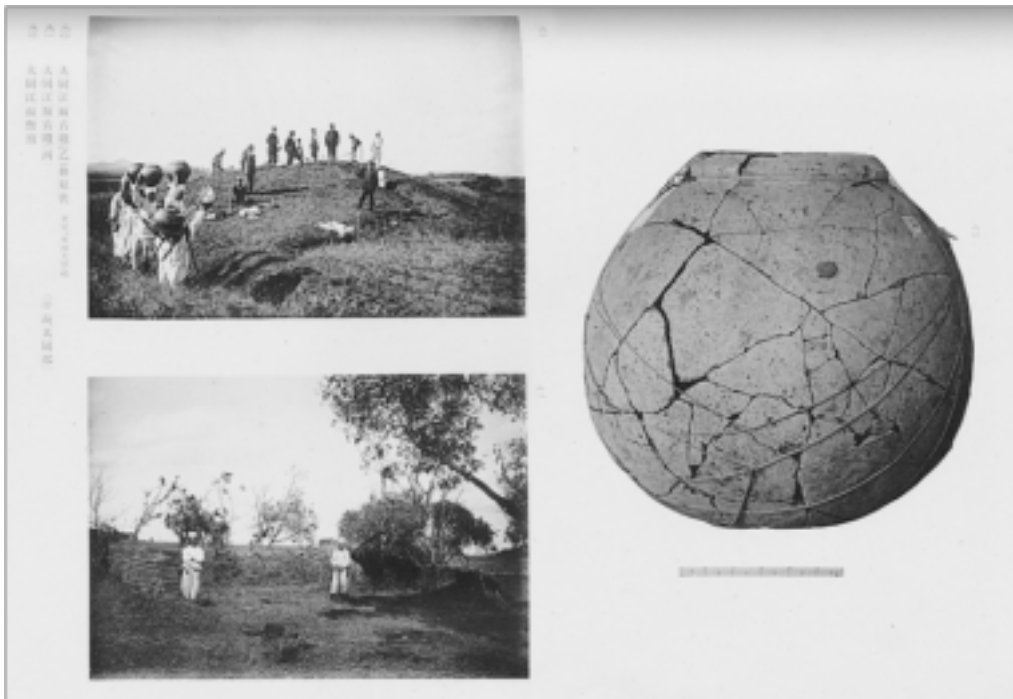
Fig.5 Excavation Scenes of Taedong-gun Han dynasty Rakurō Tombs in P’yōngyang, circa 1915. Original caption on the left indicates the tomb numbers 2 & 3. Left bottom is titled, “view of an altar.” Right is a Han stone-ware Jar.