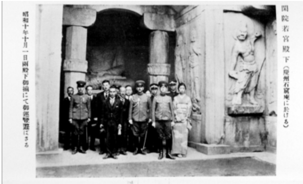
Fig. 10 Imperial Family members (Kanin-no-miya tenka Haruhito) and entourage posing in front of restored Sökkuram during their tour of Korea, October 1, 1935.