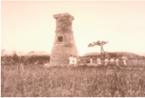
Fig. 12 Panoramic View of Ch'omsŏngdae in Kyŏngju City (c. 1915) Album of Korean Antiquities, Volume 3.