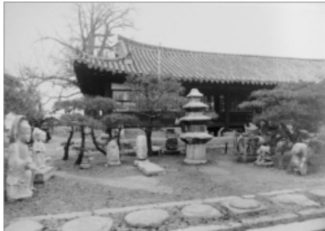
Fig. 9 Keishū Museum Grounds. It was Sekino's idea to bring in sculptures and pagodas from abandoned temples to preserve inside museum grounds. (Sekino 1931), Source : Photos provided courtesy of Yoshii Hideo, the Collections of the Kyoto University Department of Archaeology