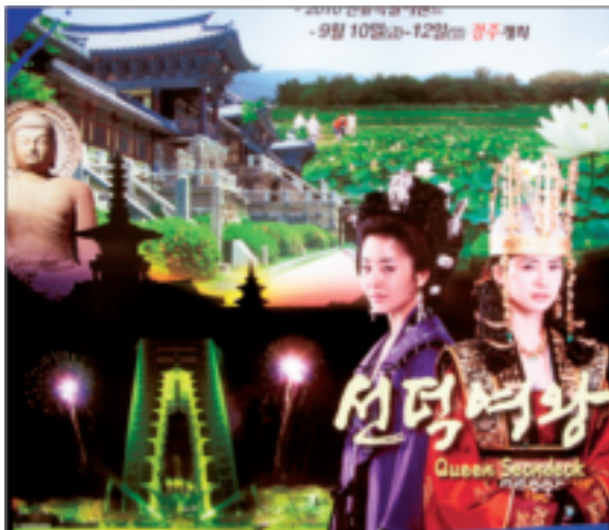
Fig. 13 Billboard for Silla Millennium Theme Park promoting Silla Festival, September 10–12, 2010. Recreated Images of Ancient Silla (c. 8th century A. D.). Clockwise from left to right: Hwangnyongsaji Nine-Story Pagoda, Sŏkkuram, Pulguksa and pagodas, Anapji palace pond, Shooting location for the hit television drama series, Queen Sŏndŏk (MBC Broadcasting Co. 2009). Author's photo Images: Pulguksa Tapo-t'ap.

as Disneyland with the purpose of providing entertainment for the whole family with easy access to an expensive hotel resort and spa built in “Royal Silla-style” architecture ( Ra-gung ). Designed as a living museum showcasing live staged historical re-enactments of Silla elite corp of warriors ( Hwarang ) with stunt actors hired to stage mock battles on horses, demonstration of martial arts and shooting bows and arrows. At night, there are also dance musical reviews with attractive dancers in gorgeous costumes retelling romantic sagas of doomed lovers, set amidst laser lighting shining upon miniaturized replicas of Silla's ancient monuments mentioned in this paper. The advertisers also proudly claim that its sets had once served as shooting locations for interior and exterior palace scenes for the hit historical romance “Queen Sŏndŏk” broadcasted by MBC station in 2009. The website advertises that the sets are now available for rent for catered banquets for events and in the case of provided gratis for weddings. 6 In my photo, the elaborately dressed females are two of Korea's most popular television stars who played the lead female roles. The right figure is that of the aforementioned Queen, who as the 27 th ruler was the last royalty de-