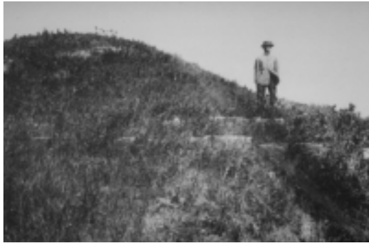
Fig. 1 Professor Sekino Tadashi of the Tokyo University surveying Koguryō tombs in Jian (c.1915).

colonial state funded scholars field collections from museum objects, printed matter, and pictorial sources in preparations for Japanese language textbooks and English language propaganda publications (Chōsen Sōtokufu 1929a, 1929b, 1935, 1939).