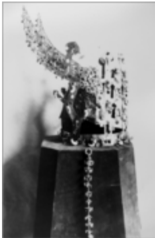
Fig. 8 Display of Gold Crown in the Keishū Museum