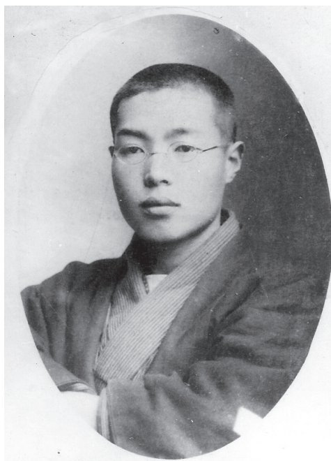
Fig. 1. Honma Hisao in his twenties.