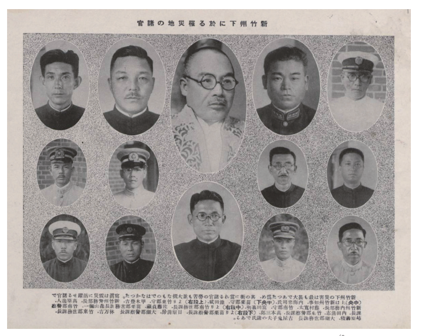
Figure 2. Utsumi Chūji and his 1935 earthquake rescue team. 40

The 1935 great Taiwan earthquake was anything but "everyday-ness," as Utsumi's diary reveals.<sup>38</sup> Utsumi is best remembered in history for his earthquake rescue work, which he oversaw for four months after the great earthquake hit Taiwan on 21 April. The whole region from Xinzhu to Taichung was seriously affected: many towns and villages were destroyed and over 150,000 persons either died or were injured. The colonial government of Taiwan acted immediately, and relief work began. It mobilized the military and sent Red Cross teams to the stricken districts.<sup>39</sup>