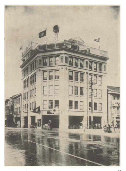
Figure 3. The Kikumoto department store, Taipei, 1932.<sup>56</sup>

The 1930s witnessed another wave of rapid development in the market for mass consumers, and the fever for mass consumption also spread to Taiwan. On 11 December 1932, the Utsumi family paid a visit to the first modern department store in Taiwan, Kikumoto 菊元, which had just opened in Taipei two weeks before on 28 November. Kikumoto was a seven storey building (including observatory), equipped with the latest elevators ascending to the fifth floor where the dining area was located. Though Utsumi only visited Kikumoto when he travelled from Xinzhu to Taipei, his diary shows that the new department store had already entered his life.