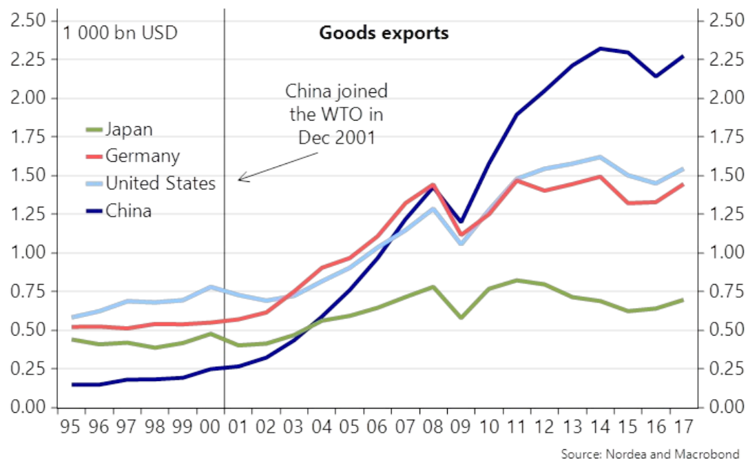
Figure 1: Goods export from Japan, Germany, US and China 1995-2017

The Chinese model of development, which unlike the liberal model is not based on a combination of economic and political liberalisation but on restricted capitalism accompanied by political suppression, has duly proven highly successful.