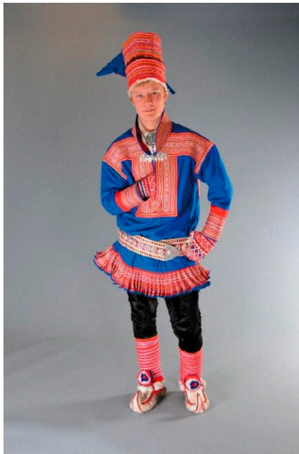
Sámi dress (from Enontekiö region)

The patterns and shapes of traditional Sámi clothing include cultural codes that the community's members are able to read including information, for example, on the region in which the person lives and their family history 38 . The use of traditional Sámi clothing is linked to significant moral values, such as an expression of the individual's identity and sense of belonging 39 , but it also has a communicative function (e.g. the clothing's details, e.g. if the clothing is turned inside out it is a sign of disapproval) and functions as a cultural communicator 40 .