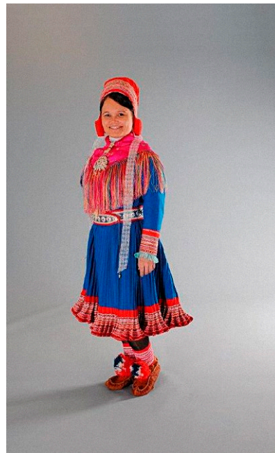
Sámi dress (from Enontekiö region)