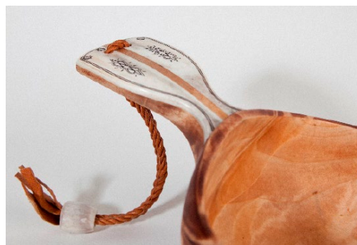
Guksi (traditional Sámi duodji-handicraft), made by Arto Saijets