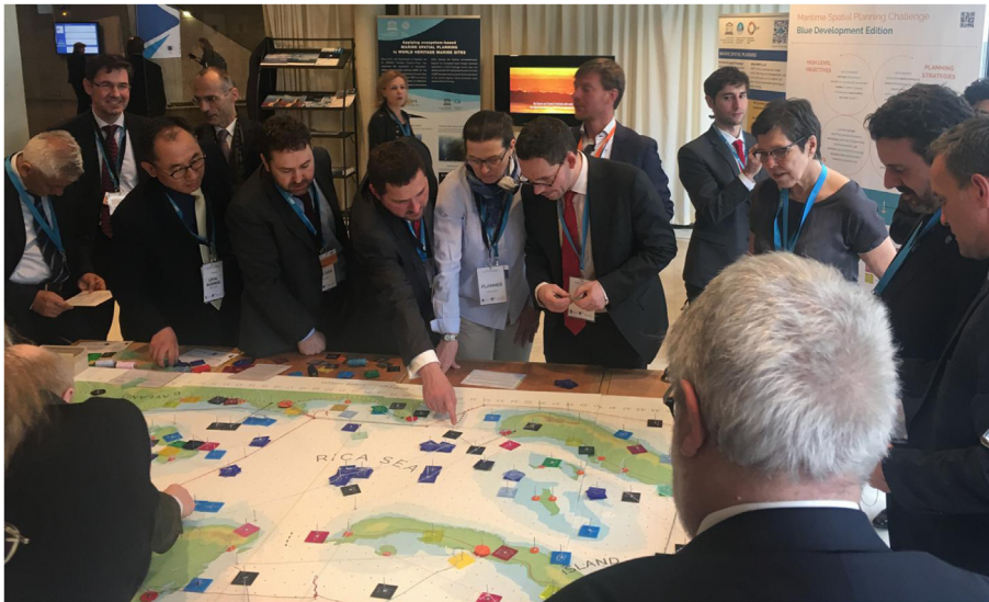
Fig. 1. Impression of the MSP Challenge warm-up board game session in Paris, March 2017.

Challenge's 'learning by doing', or 'learning by playing' approach is both enjoyable and informative for many participants. Although some find the gaming approach to public policy issues such as MSP challenging, there is no doubt that it has stimulated widespread interest and has received overwhelmingly positive reviews. Participants and observers appreciate the gaming format that creates a 'safe place' to develop a better understanding of: