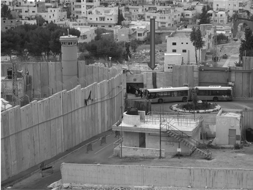
Figure 2. Rachel's Tomb, segregated..

(Isaac & Platenkamp, 2016). Instead of concepts of totality and dialectics, we focus on hope as the core element. On a daily basis, we see that still Palestinians have hope, despite of the oppression, and mechanisms of occupation. People still have hope, that one day there will be an end to this colonization and oppression, and to the occupation in all its facets. It has been clearly clarified that hope for social justice is obviously related to the needed revitalization of the critical impulse within critical thinking. This revitalization clearly is related to the success or failure of mode 3 pluralist discussions on the agora in Palestine, which can give a voice to the everyday opinions of Palestinians on these topics. This mode 3 debate stimulates the necessary hope in people's lives.