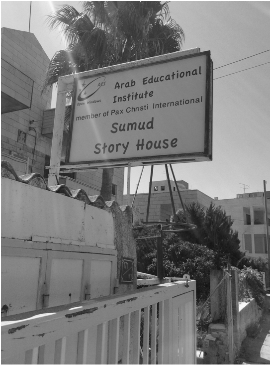
Figure 3. Sumud House, near Rachel's Tomb.

They are written or chosen by Palestinian women's groups who convene at the Sumud Story House. The project is made possible through sponsorship of individual posters. Visitors of Bethlehem are invited to visit the museum. Through individual sponsorship, the "museum" will gradually expand. The Sumud Story house is part of the Arab Educational Institute in Bethlehem, affiliated to Pax Christi. Arendt introduced the agora as a public space. This space of dialogue does take place at the Sumud house, and has the potentiality to create hope, even in such a desperate situation.