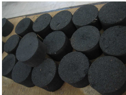
Figure 2. Photograph of MSW briquettes