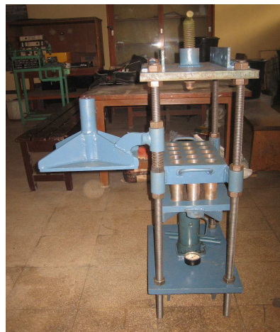
Figure 1. Photograph of presser