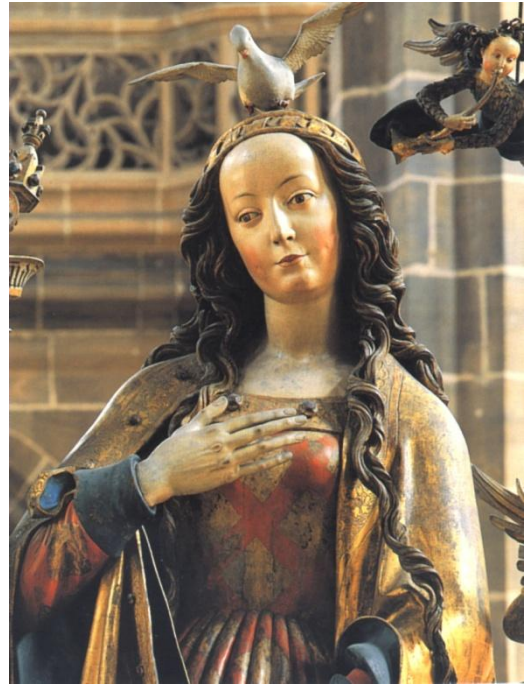
Fig. 3. Virgin Mary. From Stoss, Veit. Annunciation . 1517-1518. St Lorenzkirche. Nürnberg. Germany. Private collection.