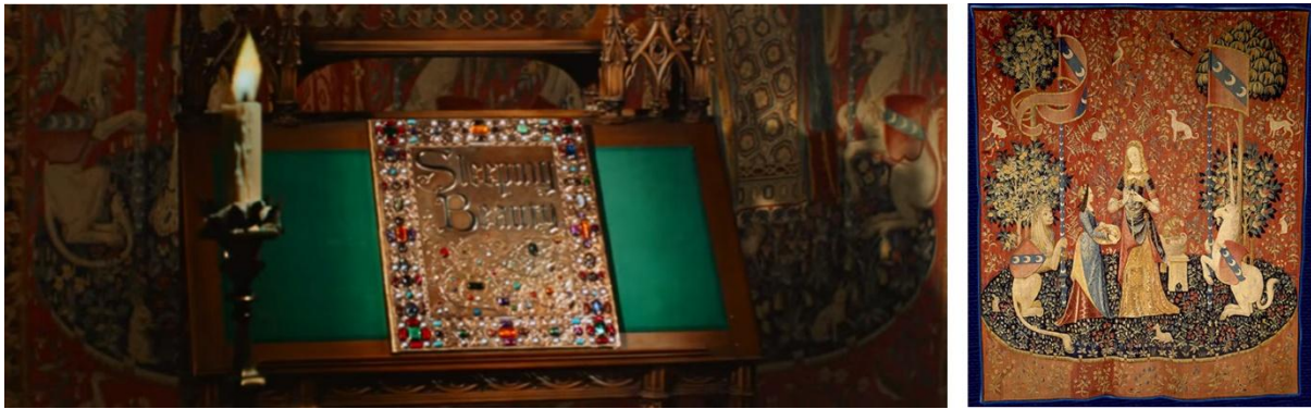
Fig. 7. One of the six medieval tapestries with the Lady and the Unicorn can be seen in the background of the opening sequence. From Unknown weaver. The Lady and the Unicorn . c.1500. Musée national du Moyen Âge. Paris. France. www.tchevalier.com . Web. 23 October 2015.