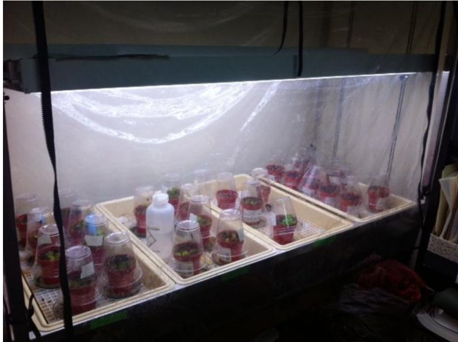
Figure 2. Plants were potted separately and placed in a greenhouse setup, with clear plastic cups as lids to keep ants inside the pots while not interfering with photosynthetic activity.