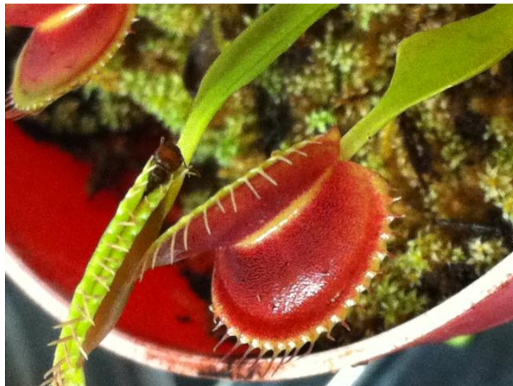
Figure 3. In group two's 2-ant feeding level, one ant attempted to escape but was still effectively captured.