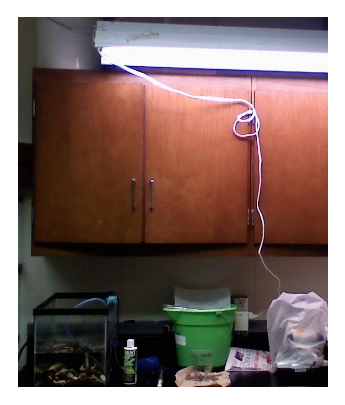
Figure 1— Geukensia demissa tank set up. This figure shows how the tank, Grow Green light, food, water quality testing equipment, and microscope were set up in the lab space.