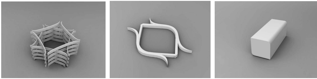
Figure 3. The three forms selected for further development, which exemplify (from left to right): Chinese form language, a merge between Scandinavian and Chinese form language, and Scandinavian form language