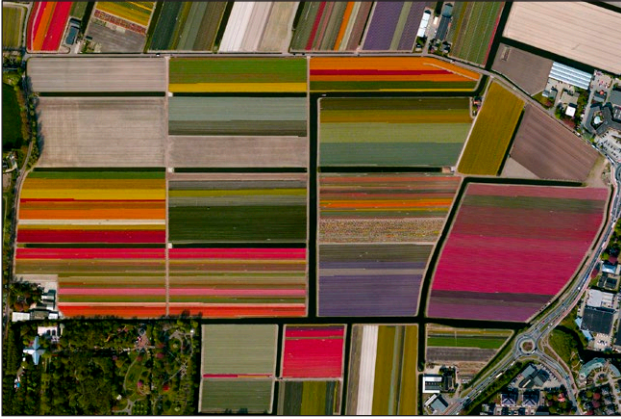
Figure 2: Fields of Tulips, Lisse, The Netherlands.