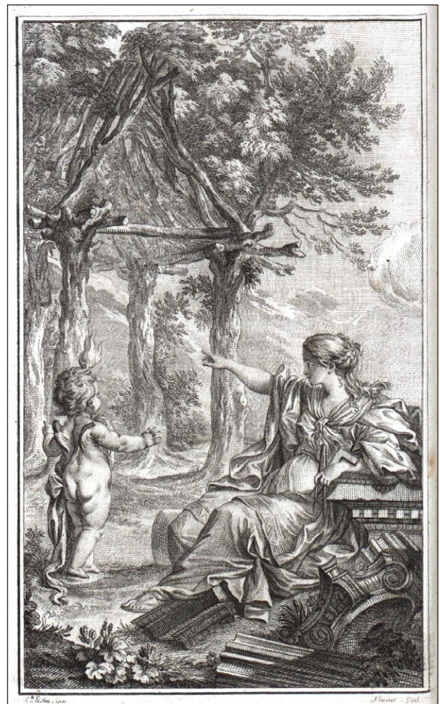
Figure 3: 'The Primitive Hut', frontispiece of the second edition of Marc-Antoine Laugier's Essai sur l'architecture , 1755. Designed by Charles Eisen.