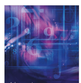
Advances in Mathematical Physics