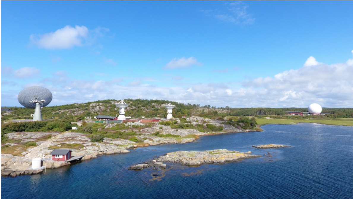
Fig. 3 The Onsala telescope cluster in 2016 with the new Onsala Twin Telescopes in the center of the photo. The new VGOS radio telescopes are equipped with reflectors of 13.2-m diameter. The radio telescope on the left hand side is the 25.6-m telescope installed in 1964, which is the first European telescope ever to be involved in VLBI. First geodetic VLBI measurements were performed already in 1968. The white radome on the right side of the picture houses the 20-m radio telescope installed in 1976, which was used with the Mark III geodetic VLBI system since 1979 and has the longest time series in the International VLBI Service for Geodesy and Astrometry (IVS) database. Close to the radome, but not visible in the photo, is the GNSS station ONSA, which was established already 1987 in the CIGNET network, several years before the International GNSS Service (IGS) was founded. ONSA had a pioneering role in the early days of GNSS, and has the longest continuous time series in the IGS network. There is also a gravimeter laboratory with a superconducting gravimeter. Shown in the picture foreground is the Onsala super tide gauge inaugurated in 2015. The observatory is one of the unique fundamental space geodetic sites that have a direct access to the sea level and co-locate VLBI, GNSS, gravimetry, and sea level monitoring. It is thus an important co-location site for the Global Geodetic Observing System (GGOS).