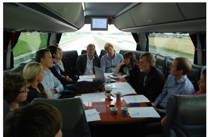
Figure 1. Workshop in the Rebo project 2011, held in a bus during a study trip

The project met a few challenges. As in the previous projects, there was a discontinuity of participants as individual employees from participating organizations were replaced during the course of the project. The researchers also underestimated the importance of informing the new participants about the specificity of the process-oriented and non-hierarchical transdisciplinary project set-up. A new participant, for whom this kind of transdisciplinary project was unfamiliar, questioned the approach and asked the researchers to take stronger leadership of the process. This event created a bit of a confusion in the arena, and even made the researchers start to question their approach and outline for the project.