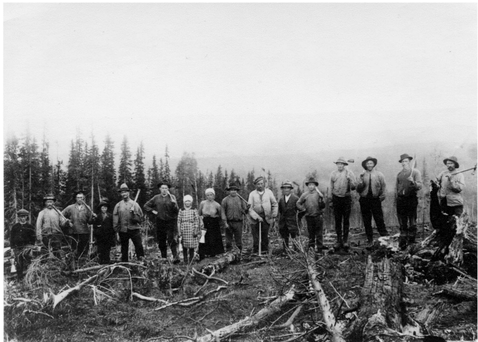
Fig. 3 Small-holder land owners and their children replanting a clear-cut area in 1903, Storuman, Sweden.