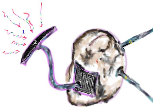
Figure 1. External information, 1, is feed to the receptor 2. The morphological computation we want to quantify is the transformation of the detected data in 2 through the channel 3 into the presentation at 4 of the stimuli to the central computation center at 5. We will not discuss any output-actions 6. Note that this separation of such parts in the process is rather arbitrarily, especially seen from an evo-devo perspective.

In Figure 1, where we depict the process of interest as the transformation between the data presented