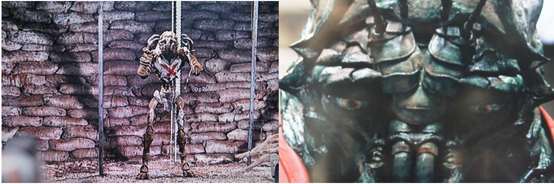
Example 9. A scared alien and a thoughtful sad alien (District 9, chapter 7 and 12)

who has just found out that his fellow aliens are tested on such a way and stands watching the dead body of one of them.