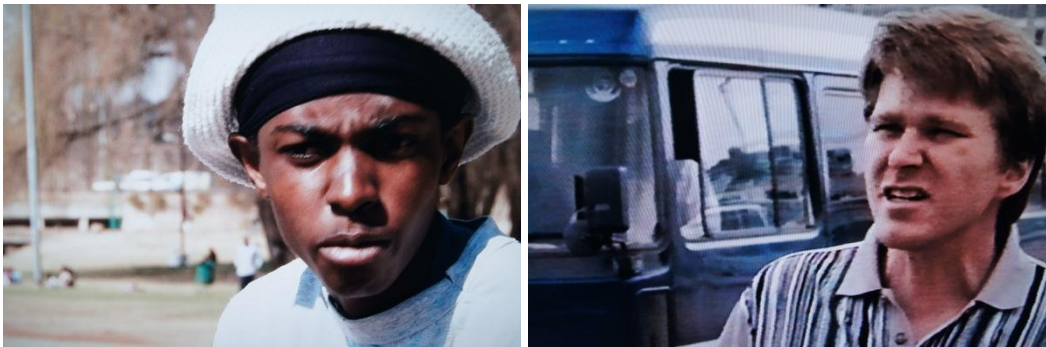
Example 1. The "real" people interviewed in District 9 (District 9: chapter 2)

The following three examples illustrate the documentary realistic style of the film. According to McConnell, hand-held cameras, actual locations and real people are typical for cinéma vérité style in contrast to Hollywood films (McConnell 1997). Example one illustrates the "real" people that are interviewed in "actual" locations. Example two illustrates the documentary use of "specialists" that are used as narrators of the film. Their purpose is to open up and bring forth the realistic issues surrounding and supporting the plot of the film. Example three illustrates the documentary style use of news footage.