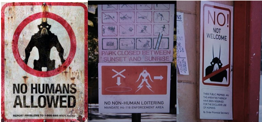
Example 4. Signs in the film (District 9, chapter 1)

Example four demonstrates how the film uses signs as symbols of reality in a transrealistic style. Here these new signifiers, based on the novum of a literal alien, must be signified on the basis of other signifiers in order to understand the meaning of the signs. In other words, these signs demand speculation between reality and the novum. However in this case, this speculation can hardly be described to be open to various interpretations as Johnson-Smith suggested. When these actual plaques are interpreted on the basis of their real life correspondents, the interpreter is once again faced with a one-to-one comparison metaphor instead of a vague symbol, for the interpreter is used to connecting such signifiers to certain real life signifiers.