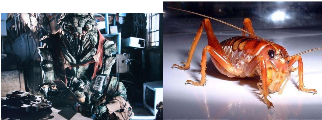
Example 8. The alien "prawn" of District 9 (District 9, chapter 14) and the "Parktown prawn" of Johannesburg (io9, 2009)

The appearance of the aliens of District 9 has its origins in reality. The humans have started to call the aliens "prawns", which they are even said to look like by an interviewed man. Their appearance has a strong resemblance to what is called "The Parktown Prawn", which is a common unwanted pest in Johannesburg's gardens (Intekom 1999). The following example 8 demonstrates the similarity between the alien "prawn" and the "Parktown Prawn".