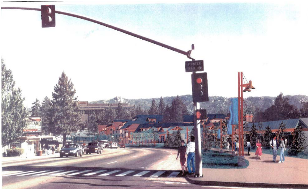
Figure 4. Simulation of Proposed Project from Viewpoint 1.