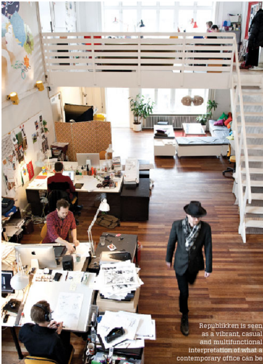
Republikken is seen as a vibrant, casual and multifunctional interpretation of what a contemporary office can be